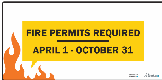
Figure 1 – Wildfire Prevention Sign 1