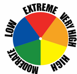
Figure 6 – Wildfire Danger Sign