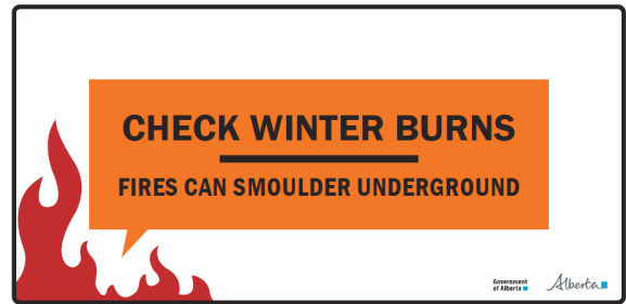
Figure 5 – Wildfire Prevention Sign 5