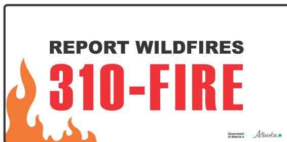
Figure 3 – Wildfire Prevention Sign 3

The Wildfire Danger sign is included below. It consists of a white and black background with a triangular cutout to show the level of wildfire risk. A multi-coloured pinwheel that can be manually turned is placed behind the sign. Turning the pinwheel changes the color and level of wildfire risk shown in the triangular cutout. The standard size of the Wildfire Danger sign is 1.22 meters by 1.42 meters (48" x 56") and the pinwheel measures approximately 1.2 meters in diameter.