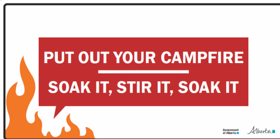
Figure 2 – Wildfire Prevention Sign 2

The Wildfire Danger sign is included below. It consists of a white and black background with a triangular cutout to show the level of wildfire risk. A multi-coloured pinwheel that can be manually turned is placed behind the sign. Turning the pinwheel changes the color and level of wildfire risk shown in the triangular cutout. The standard size of the Wildfire Danger sign is 1.22 meters by 1.42 meters (48" x 56") and the pinwheel measures approximately 1.2 meters in diameter.