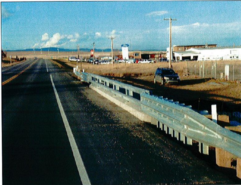
Looking North along the east rail. The access to the gas plant is behind vehicle