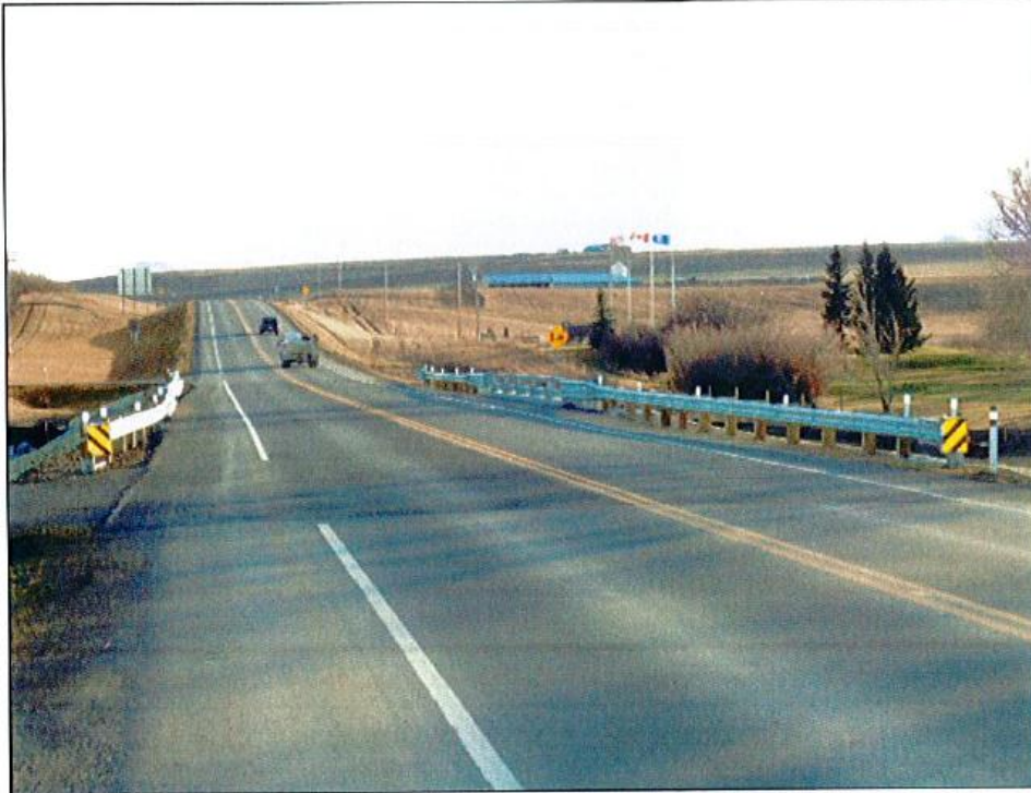
Looking South. Access to residence is on the left near the end of guardrail