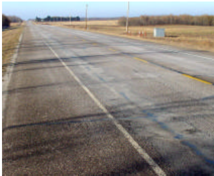
80-100A air blown, 102 cracks/km

In Alberta, 150-200A asphalt is used on heavily travelled highways while 200-300A asphalt is used on lower volume roadways. The 300-400A grade is used on some very low volume northern highways as rutting is less likely to occur. The Technical Standards Branch continues to explore new asphalt cements, including modified Performance Grade (PG) asphalt, which provides better low temperature performance.