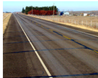
150-200B 183 cracks/km