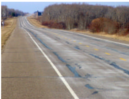
150-200A 33 cracks/km