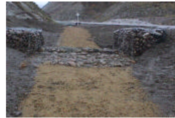
Geo Cell (brown gravel) channel

Rather than in-filling the erosion gullies as done several times previously, an erosion control design was requested from the consultant. The consultant presented several alternatives, including geo-cell and gabion-lined channels. At Alberta Transportation's request it was decided to pursue the geo-cell alternative at a trial site since the department had no experience with geo-cell technology. If geo-cells turn out to be a successful alternative to gabion channels, the department can install it in other locations with confidence.