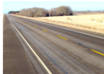
300-400A 1 crack/km