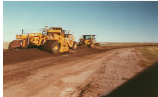
The pulveriser and the grader mixing and laying out the material

Several problems were encountered. The first major setback was not being able to monitor the amount of oil being added to the mixture. The intention was to add only two to three percent oil content but the resultant mixture had over five percent (MC-250 1 was used). The monitoring device on the pulverizer was inaccurate and fluctuated depending on the speed of the machine. As a quick fix, the so-called “snowball” test (squeeze a handful of oily gravel - if it barely sticks together, then the oil content is about right) was used and appeared to work satisfactorily. For future work, it is highly recommended to install a calibrated pump system on the pulverizer.