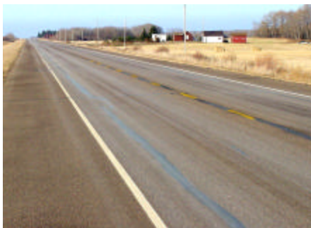
200-300A 10 cracks/km