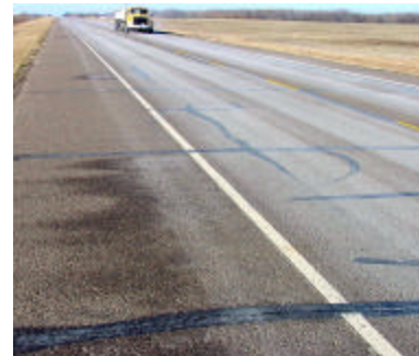
80 – 100B air blown, 146 cracks/km