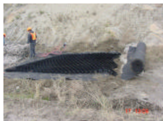
Geo-Cell webs stretched and laid on geotextile

Ledcor, the maintenance contractor for the Drumheller area installed the geo-cell in October, 2002, under the supervision of department operations personnel. Construction was quite straightforward. First, the gullies were in-filled, the channels shaped and graded to the design grade and width. Geotextile was laid, the geo-cell extended over the geotextile, and pinned into the channel bed. Gravel was then placed into the geo-cell open matrix, and levelled. Check weirs constructed of gabions were also installed along steeper portions in order that runoff velocity would be further reduced. Gabion baskets and ripraps were also placed at the inlets and outlets of culvert pipes to reduce scouring.