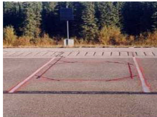
Completed Installation Edson WIM Site 1999.09.16

The Edson site recorded 953,516 events for the period of January 1, 2001 to December 31, 2001 of which 924,895 or 97.00 percent were correctly classified and weighed.