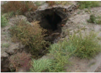
Subterranean erosion channel is formed below the east ditch in Highway 837:02