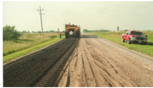
Mixed gravel/road surface after first pass of pulverizer