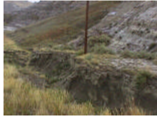
Deep erosion gully is formed on the west ditch in Highway 841:02