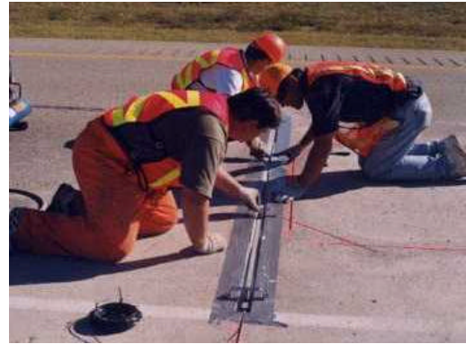
Installing Piezo Sensor into Slot Edson WIM Site 1999.09.16

Calibration of the WIM monitors indicate that they measure speed and vehicle type correctly but do not measure vehicle weights accurately enough to be used for enforcement purposes.