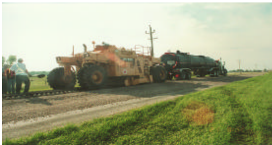
Pulverizer pushing oil tanker on first pass

To accomplish this multi-task capability, the contractor used a pulverizer machine called the Reclaimer/Stabilizer. A lift of gravel was spread on the existing road surface, and then the pulverizer was used to mix the gravel with the road surface while applying the new oil. The mixed material was then compacted using a rubber tire roller. The intent was to create a durable cold-mix-like surface.