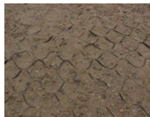
Geo-Cell – filled with gravel and sand and levelled

The following table summarizes potential cost savings in the maintenance of the ditches in these two highway sections before and after geo-cell construction. Based on these values, the Geo-Cell technology could pay for itself, through maintenance cost savings, in about four years.