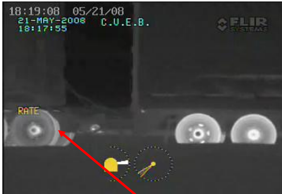
Cold center – no brake heat

Below you will find several examples of brake defects.