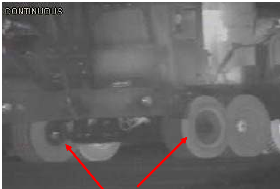
Axle #1 – Service Rig – no brake heat