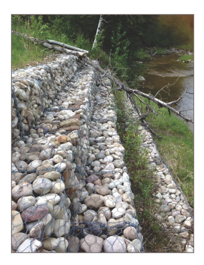
Photo 7: Modeste Creek at toe of sideslope protected from erosion with Gabion baskets