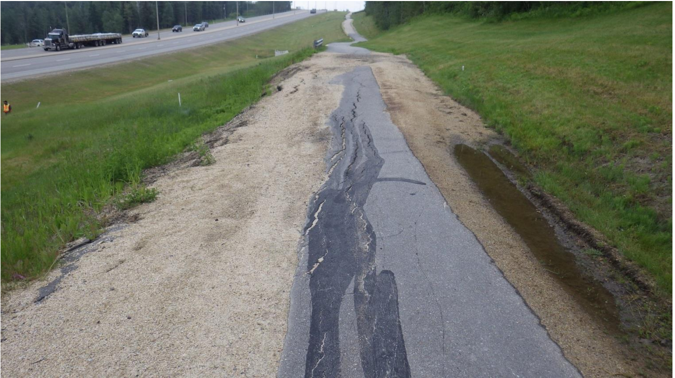
PHOTOGRAPH 11: Pondered water on south side of walking trail above the surficial failure, facing east.