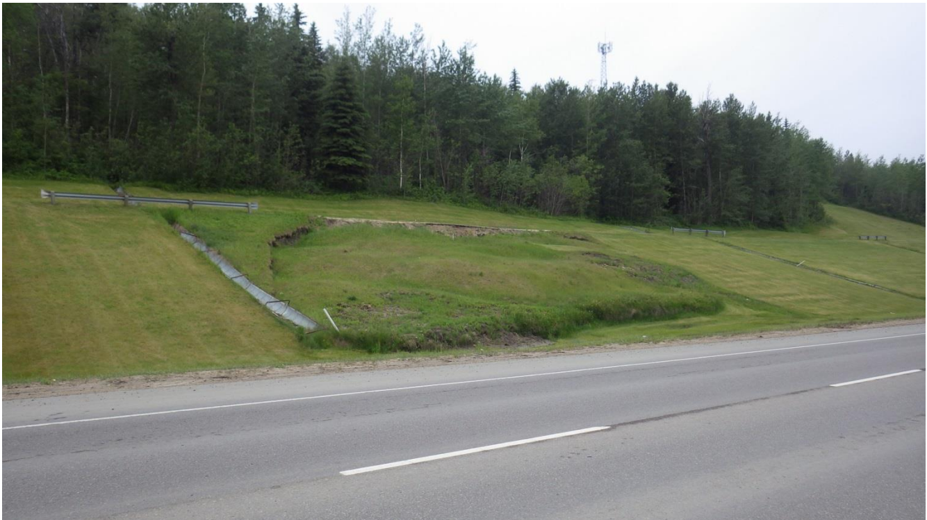
PHOTOGRAPH 8: Surficial backslope failure, facing southwest.