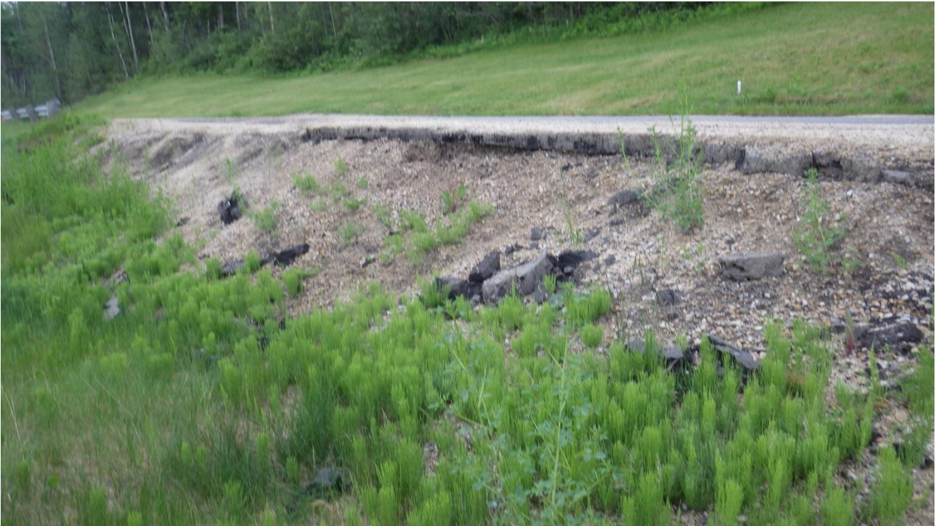
PHOTOGRAPH 9: Backscarp of surficial failure undermining walking trail, facing south.