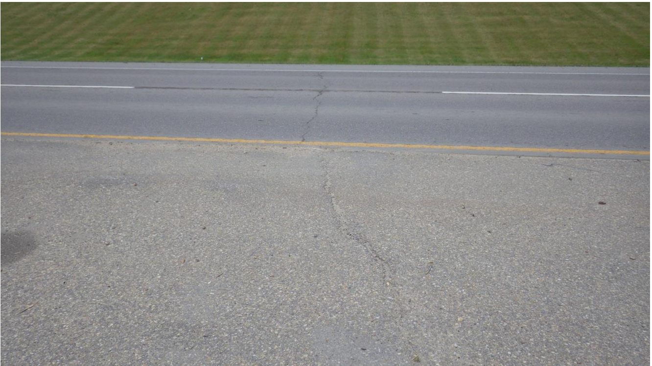
PHOTOGRAPH 4: Transverse crack in westbound lane and on median near Station 1+775, facing north.