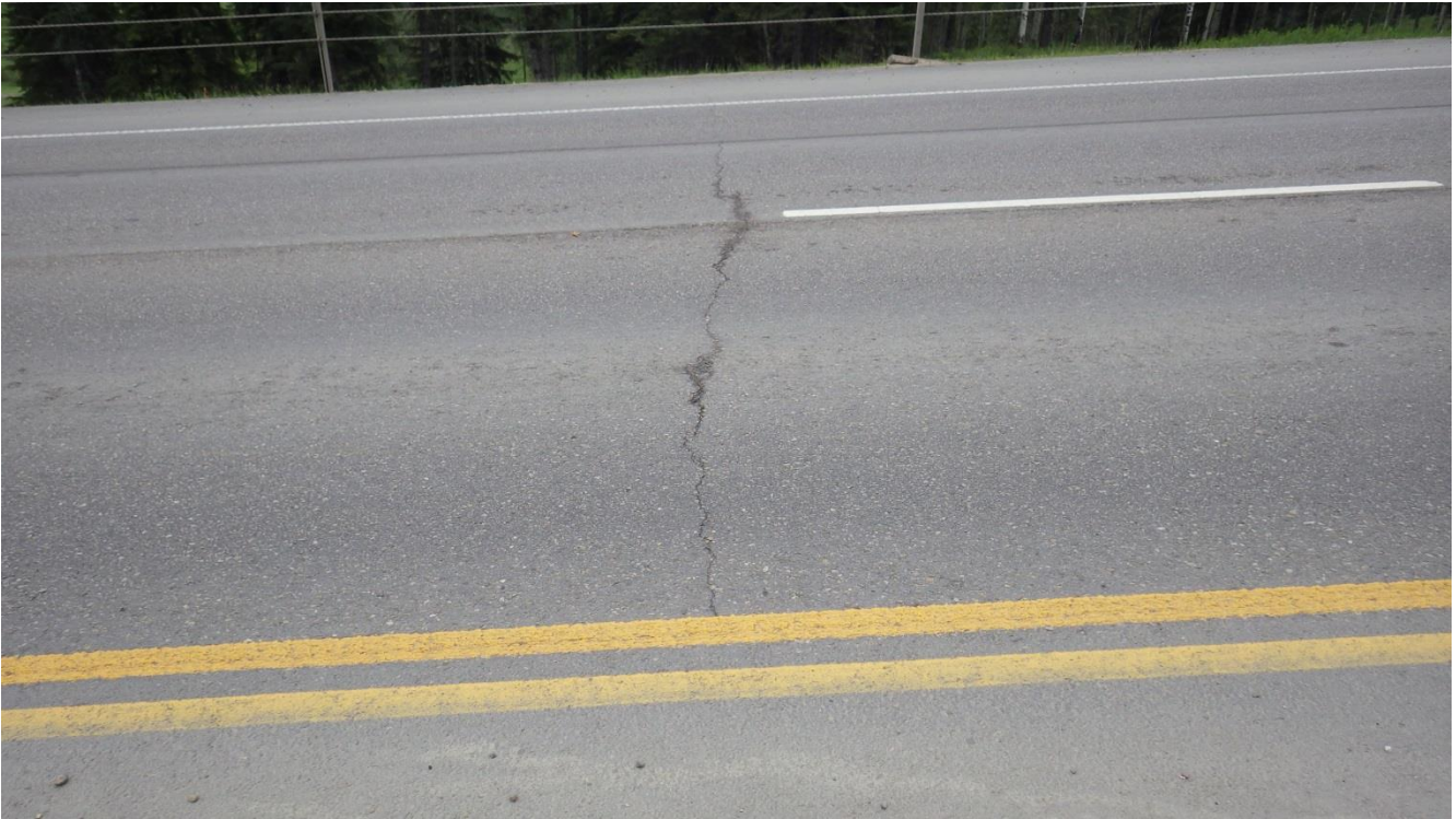
PHOTOGRAPH 3: Transverse crack in westbound lane near Station 1+800, facing north.