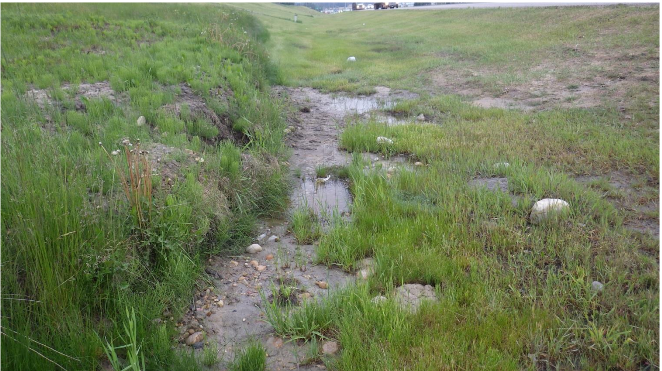
PHOTOGRAPH 10: Ponded water near toe of surficial failure, facing west.