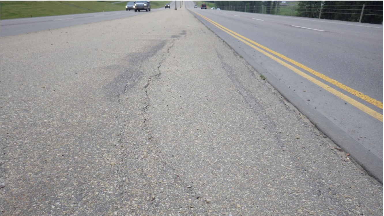
PHOTOGRAPH 5: Crack in meridian near west crack, facing west.