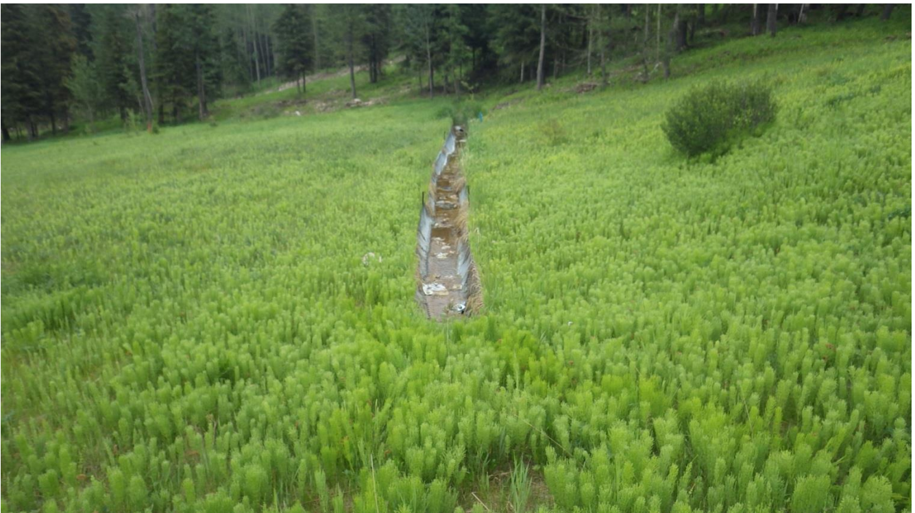
PHOTOGRAPH 12: Garbage accumulating in half-round culverts, facing east.