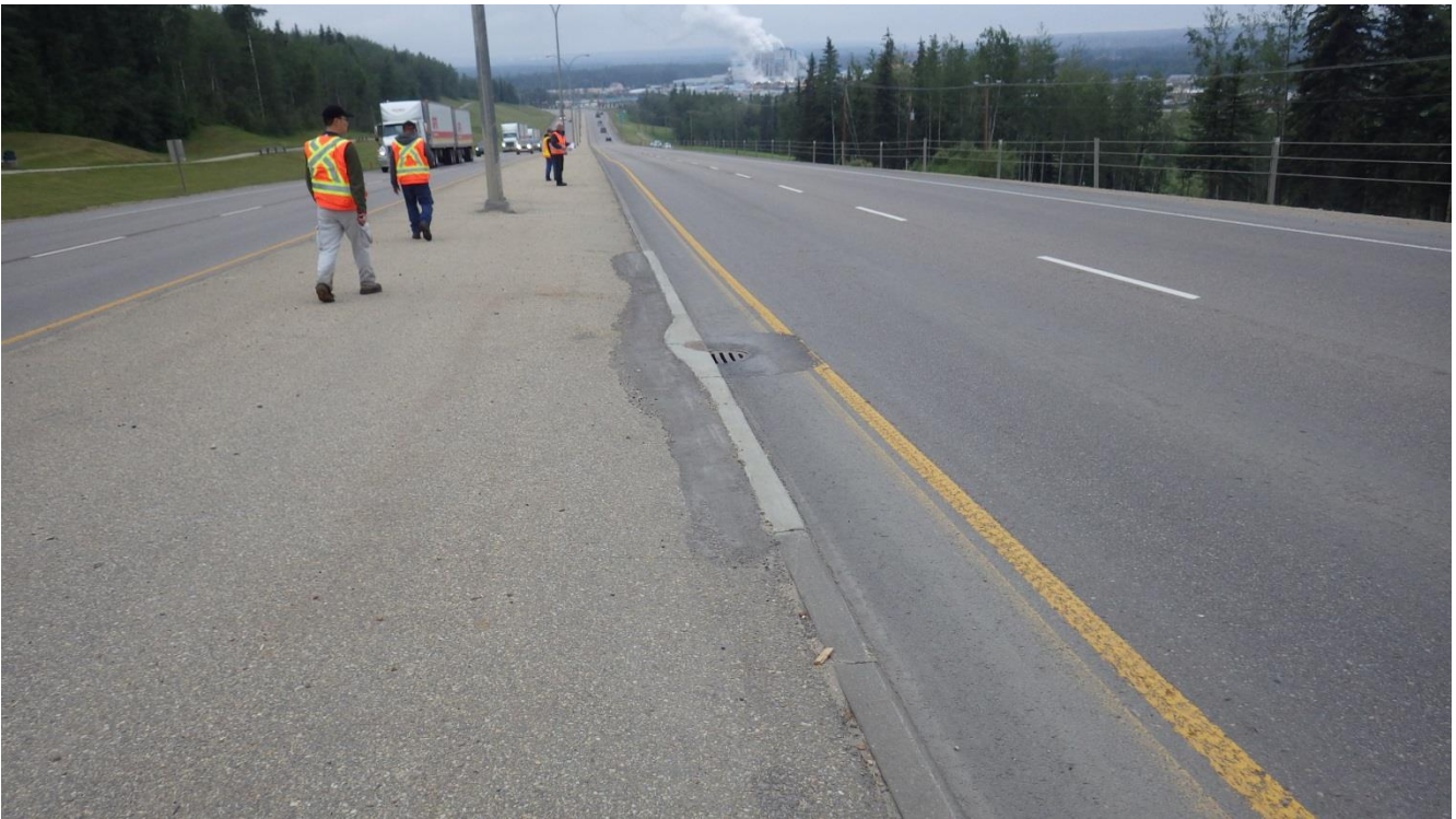
PHOTOGRAPH 6: Patching completed around the catch basin, facing west.