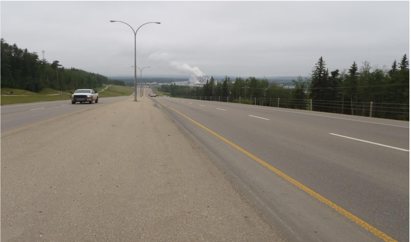
PHOTOGRAPH 1: East and westbound lanes overlaid in the Fall of 2014, facing west.