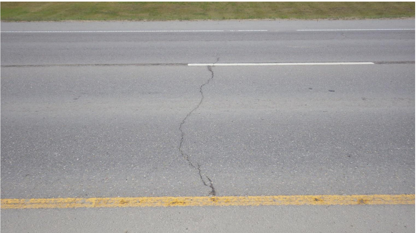
PHOTOGRAPH 2: Transverse crack in eastbound lane near Station 1+950, facing south.