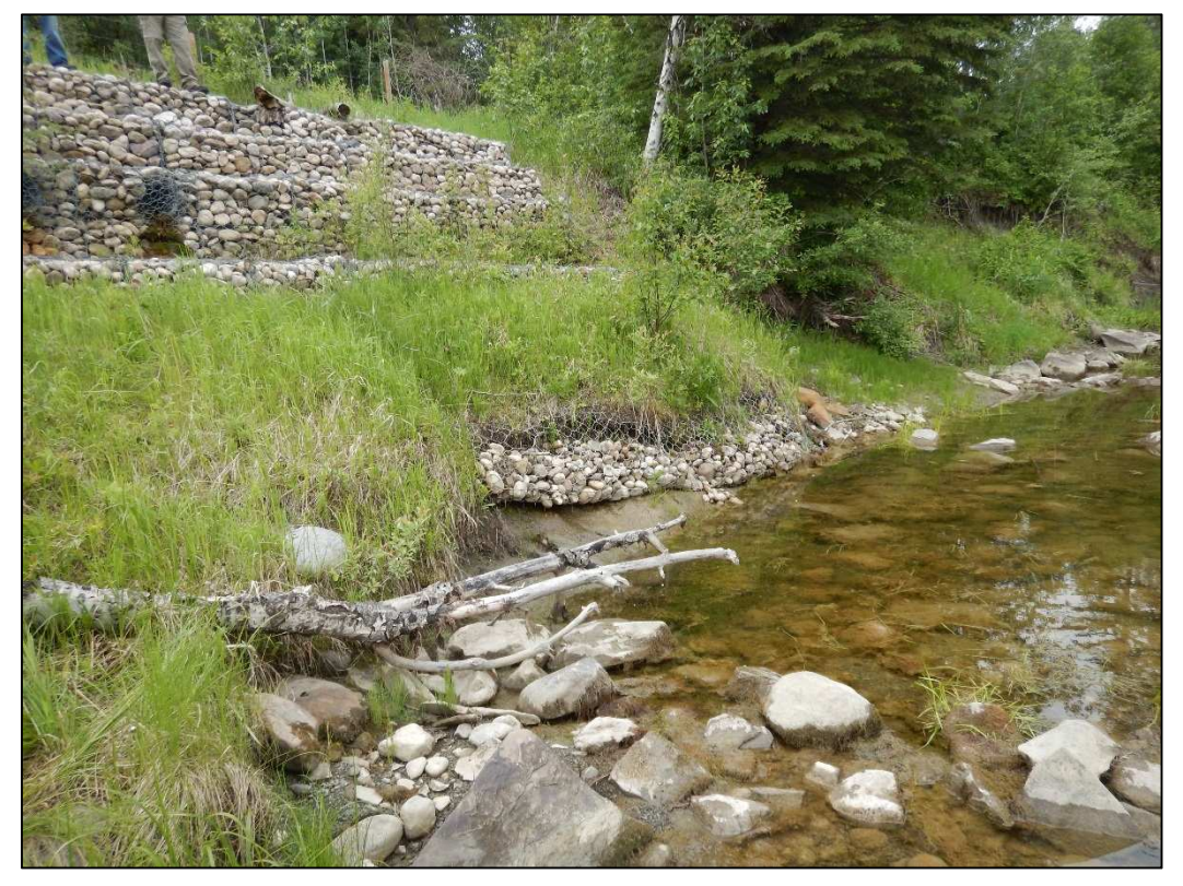
Photo 4: Erosion and deformation of gabion baskets along riverbank at toe of slope