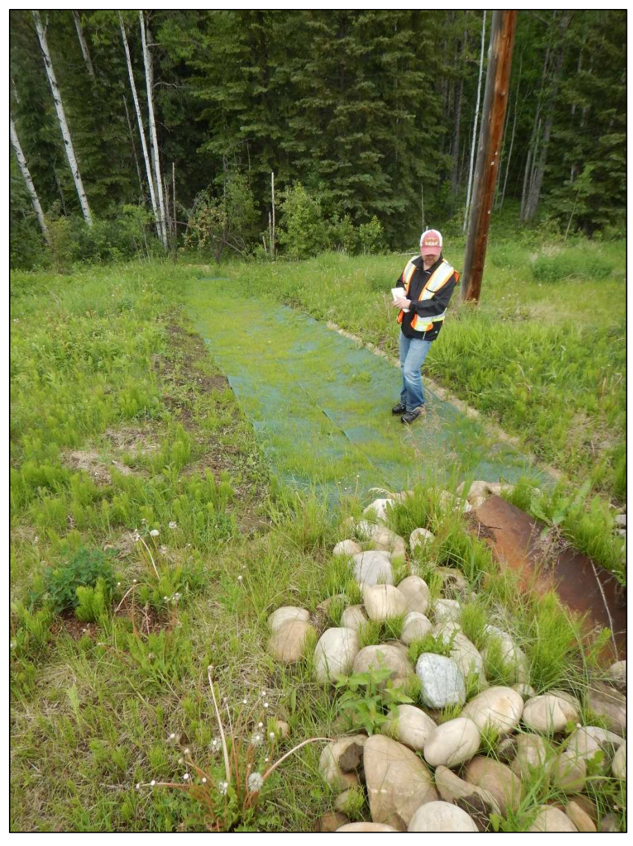
Photo 1: Recently installed erosion and sediment control at outlet of east culvert