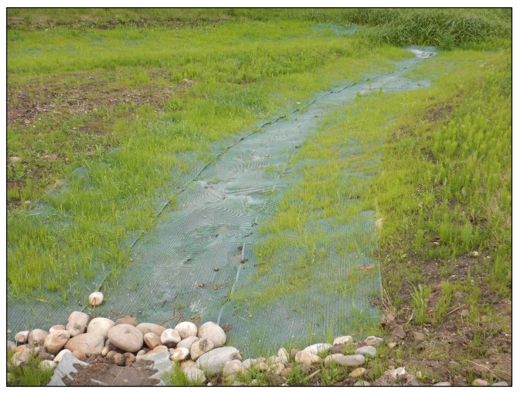
Photo 6: Erosion and sediment control installed along drainage path immediately west of the site