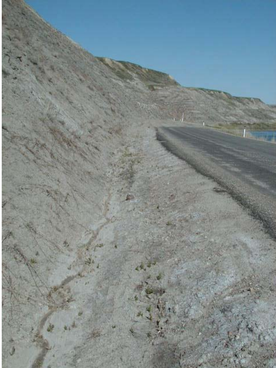
Well defined ditch on backslope side of highway