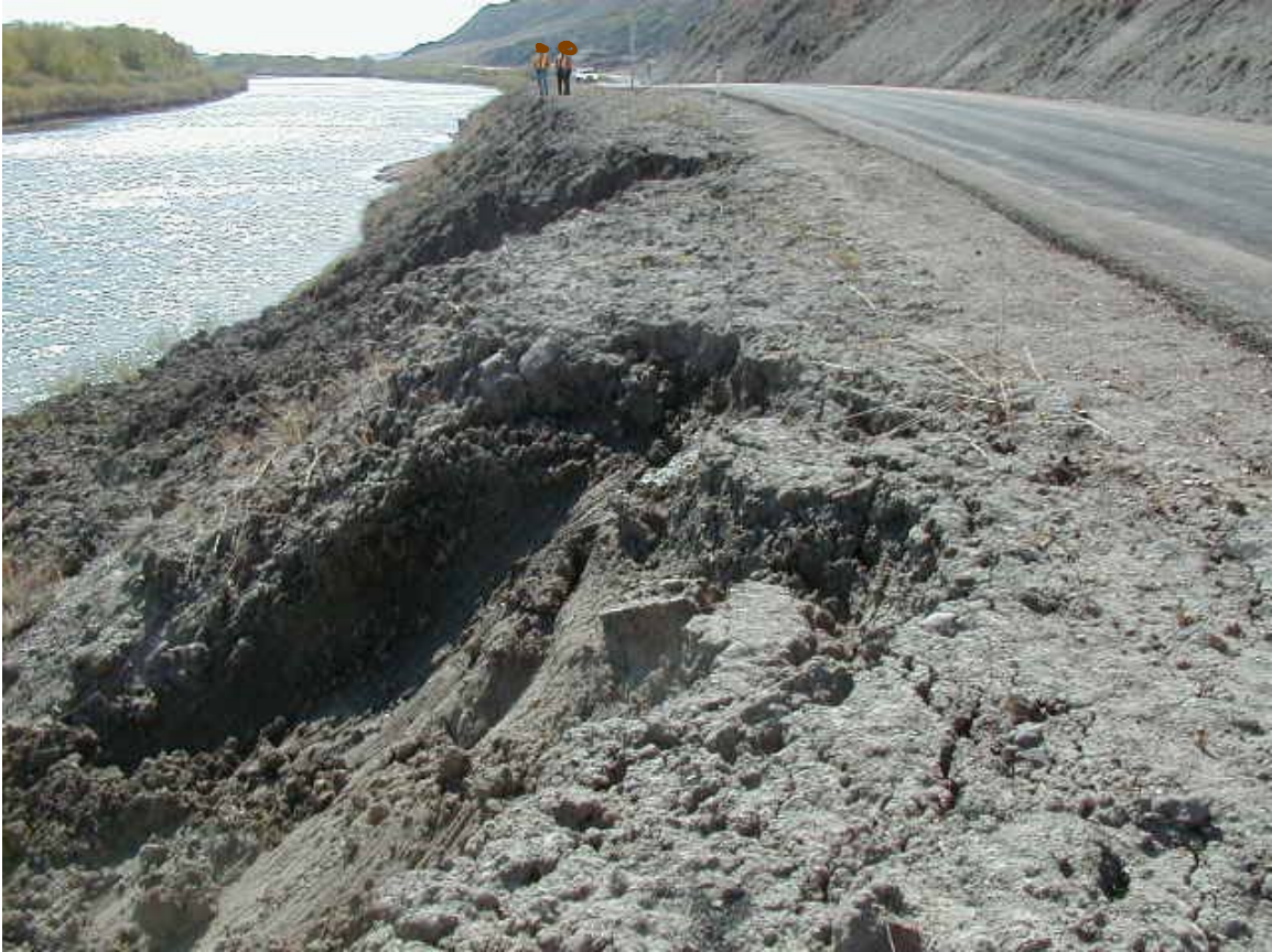
Two new unstable areas have appeared with scarps regressing towards the pavement