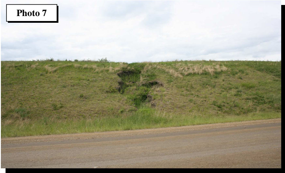
Looking west (another view) - Erosion gully at backslope at upper portion of river valley