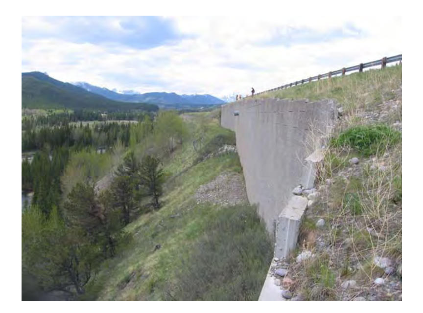
Photo 1 (top) – June 2009 Facing westbound across the wall face, showing the relative position of the highway, wall and steep slope below the wall.