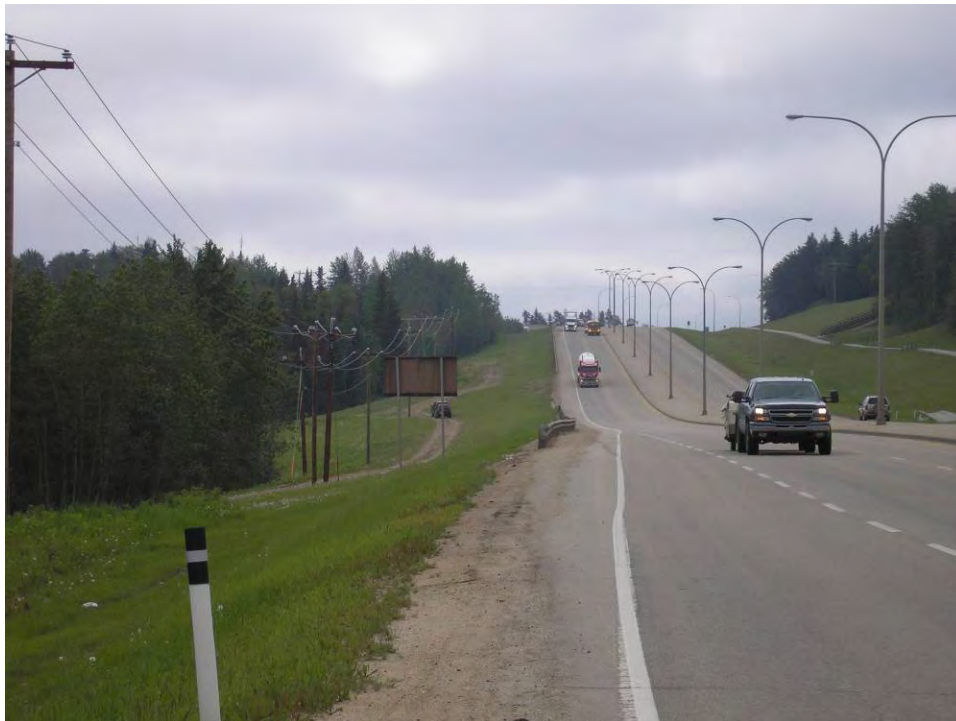
Photo 4 – Looking east along north guardrail (west of Photo 3), June 11, 2007