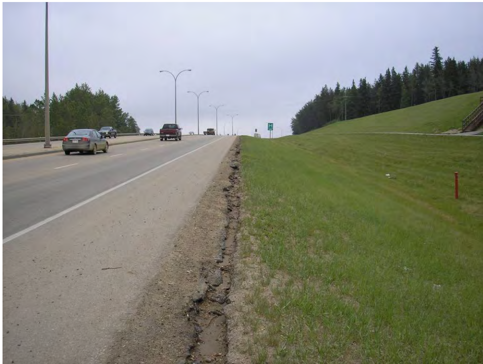
Photo 6 – Looking east at erosion along eastbound lanes, June 11, 2007.