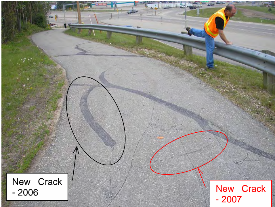
Photo 7 – Closer view of new crack to south of existing cracks, June 11, 2007.