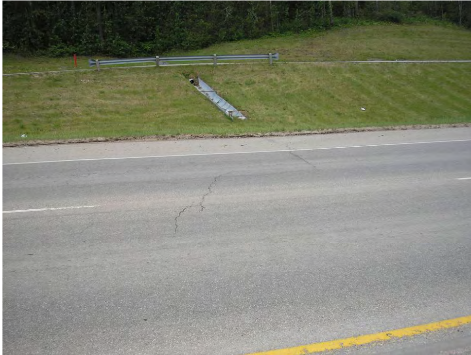
Photo 5 – Gentle dip and pavement crack at Sta. 1+770, June 11, 2007.