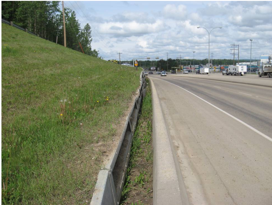
Photo 9 – Looking west at bin wall (Station 1+200), June 11, 2008.