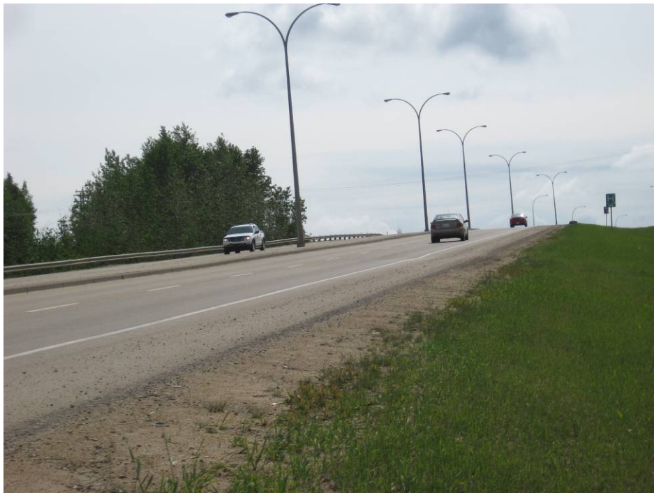
Photo 4 – Looking east at repaired shoulder and culvert dip (Station 1+770), June 11, 2008.