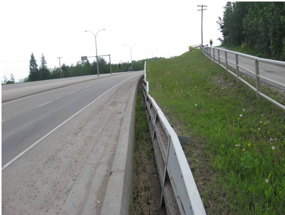
Photo 10 – Looking east at bin wall (Station 1+200), June 11, 2008.