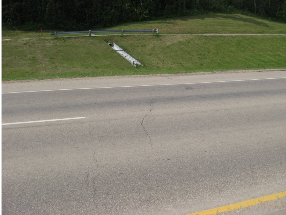
Photo 5 – Gentle dip and pavement crack at Station 1+770, June 11, 2008.