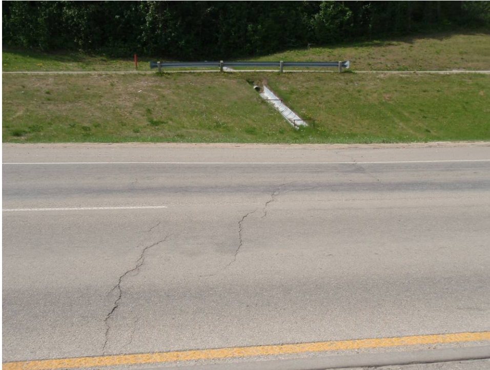
Photo 7 – Gentle dip and pavement crack at Station 1+850 (June 15, 2009).