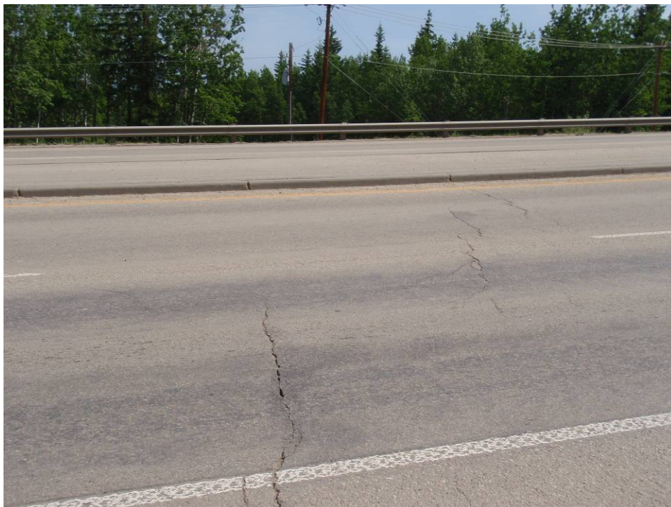
Photo 6 – Looking northeast at culvert dip at Station 1+850 (June 15, 2009).