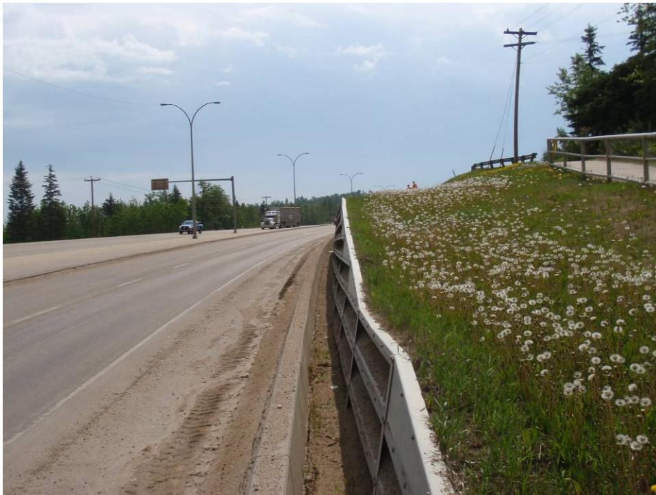
Photo 12 – Looking east at bin wall (Station 1+200) (June 15, 2009).