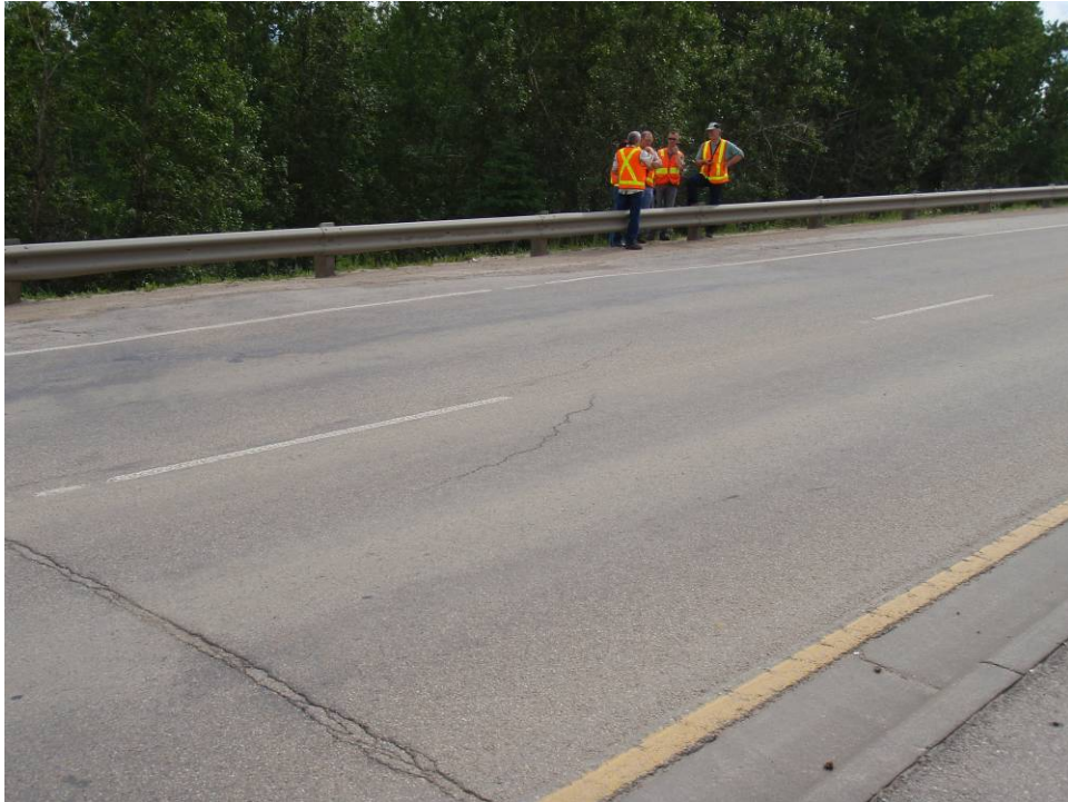
Photo 1 – Looking northeast at catch basin cracks (June 15, 2009).