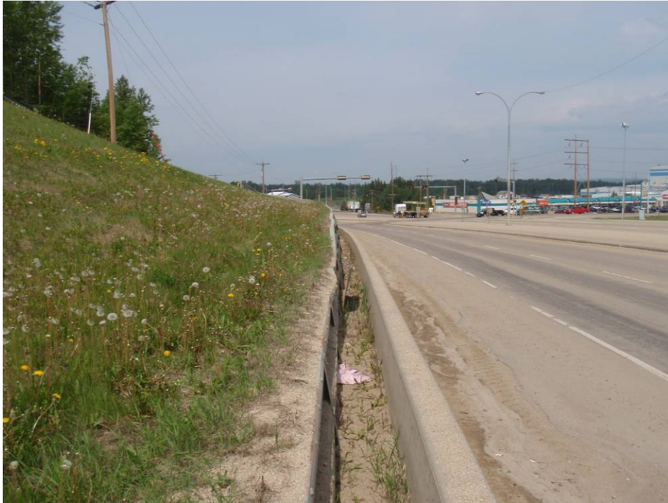
Photo 11 – Looking west at bin wall (Station 1+200) (June 15, 2009).