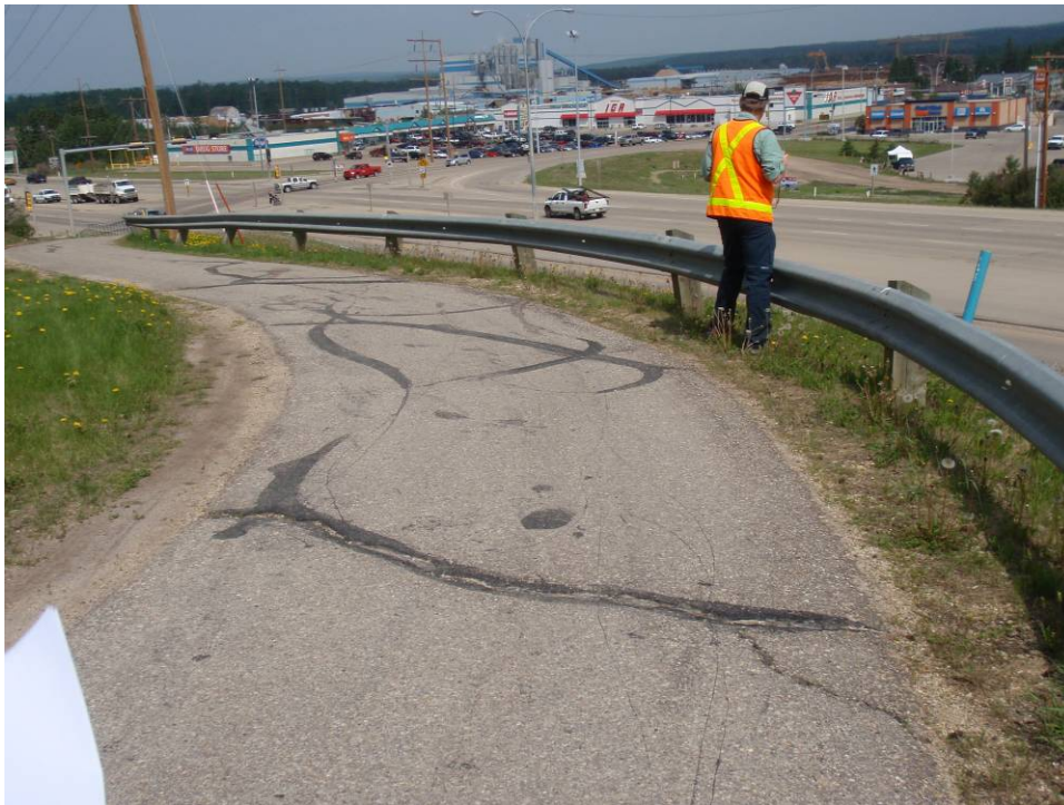
Photo 8 – Looking west at cracks above bin wall. Note tilt of SI30 casing just beyond guardrail (June 15, 2009).