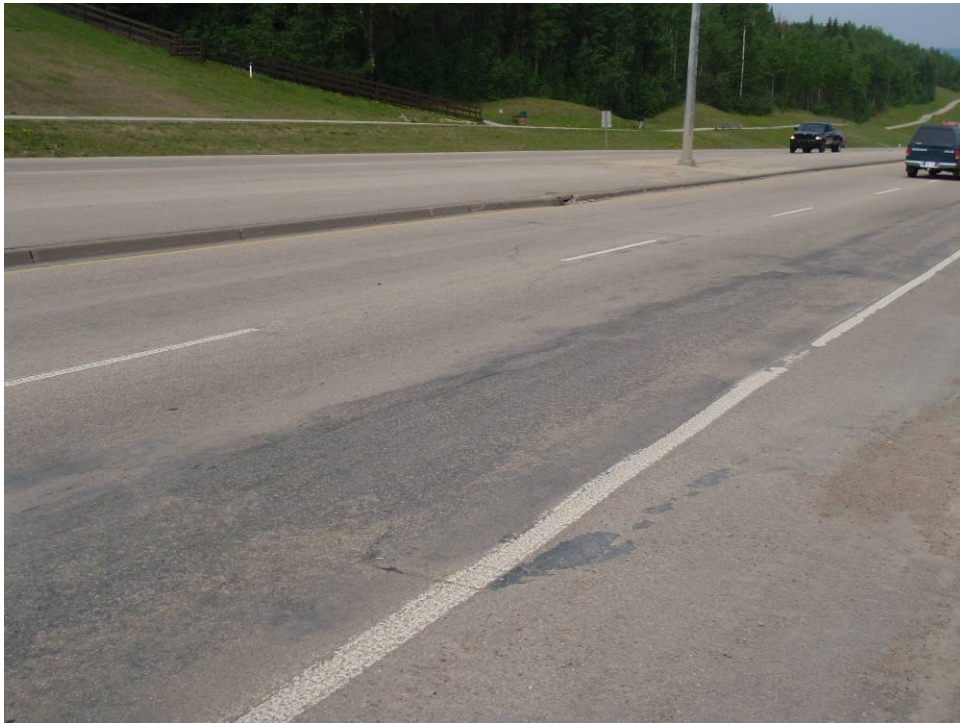
Photo 2 – Looking southwest at catch basin cracks (June 15, 2009).