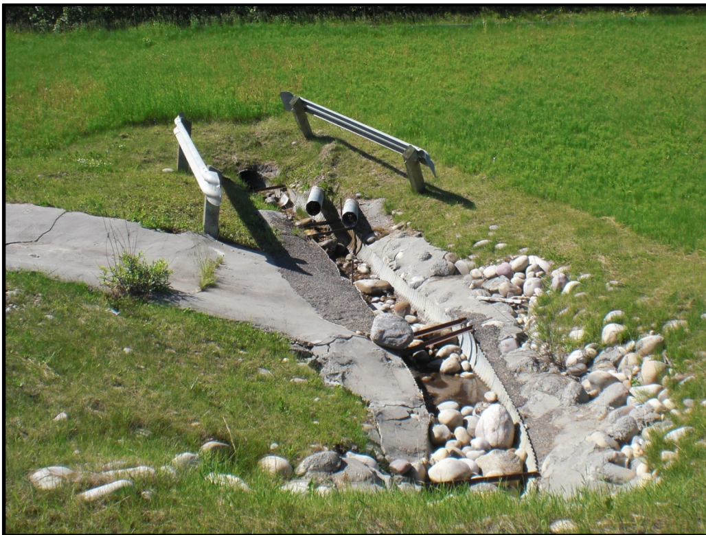
PHOTO 9: Concrete spillway and culvert at approximately Station 1+650.