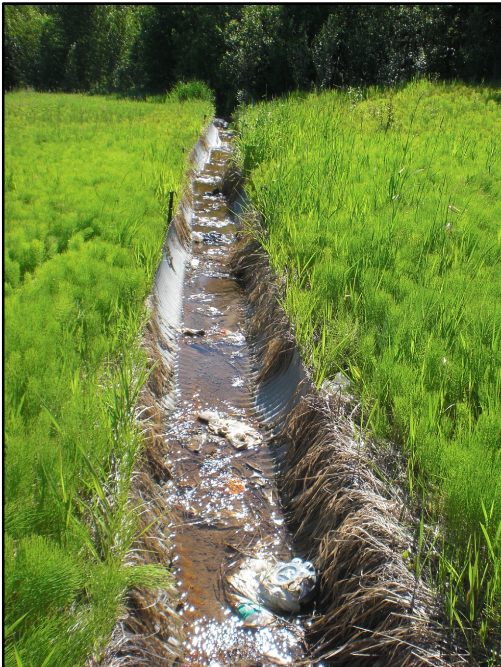
PHOTO 11: Half round surface culvert, North side of Hwy 43, facing East.