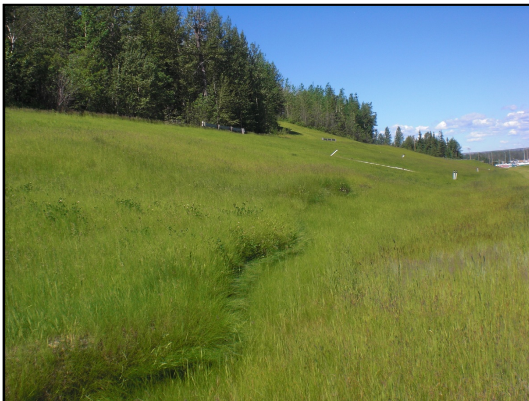
PHOTO 6: Toe bulge of surficial slope movement in Hwy 43 backslope (Approx. Sta. 1+600).