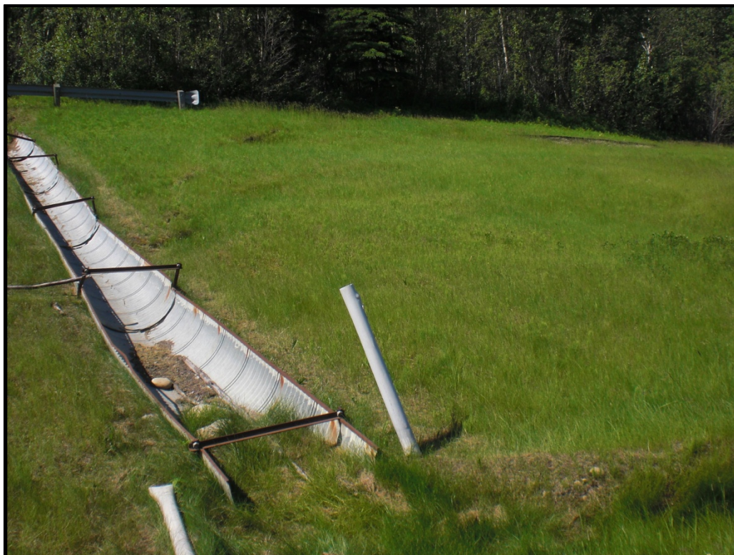
PHOTO 5: East end of surficial slope movement in Hwy 43 backslope (Approx. Sta. 1+600).