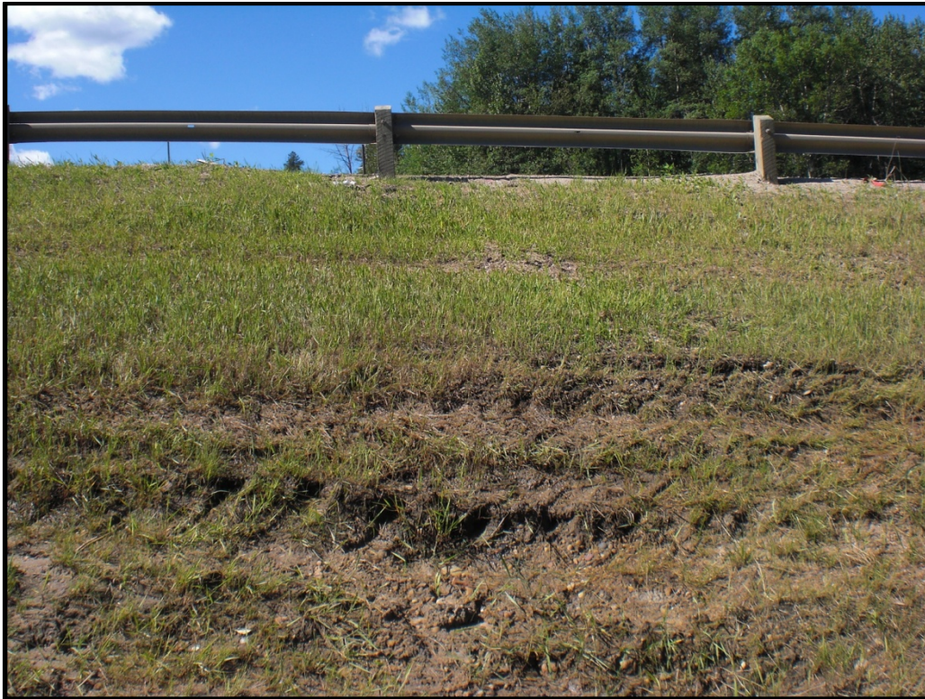
PHOTO 8: Seepage in North embankment slope at approximately Station 1+950.