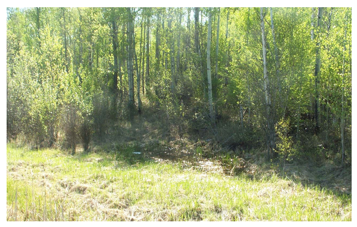
Ponded water east of the abandoned culvert