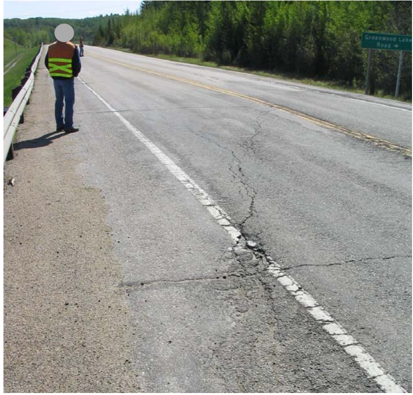
Pavement crack west side looking southeast