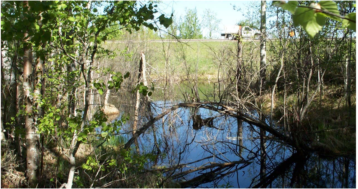
Main ponded water location looking north.