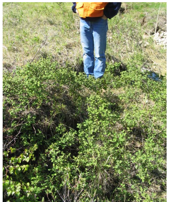
Slump scarp forming down slope of the west culvert.