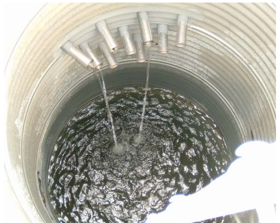
Photo 6 – Subhorizontal drains manhole (photo taken two month after the site visit) (2005).