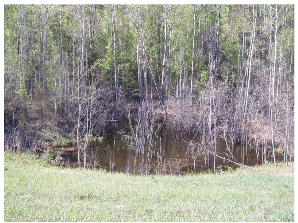
Photo 5 – Pond water at the blocked culvert inlet location (2005).