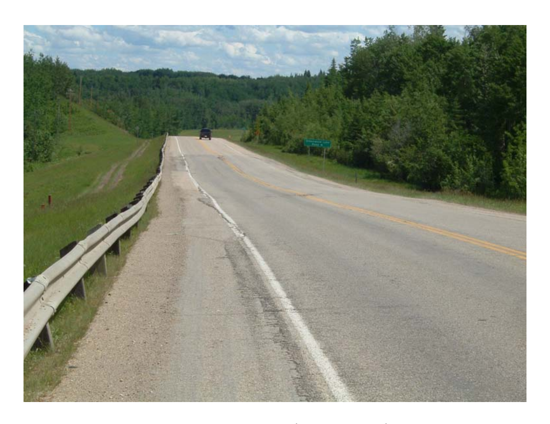
Photo 1. Pavement distress area (looking east), note pavement dips at the centre (2005).