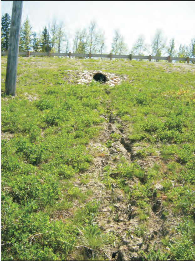
Photo 3 Discharge end of culvert on north sideslope; note the erosion occurring below outlet