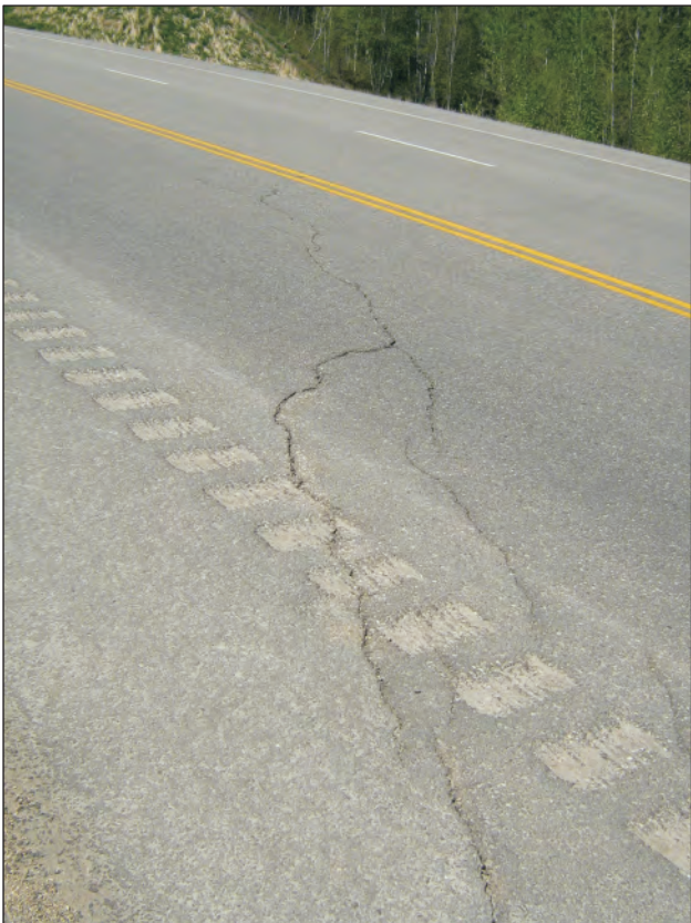
Photo 6 Cracking of pavement near west flank of slide