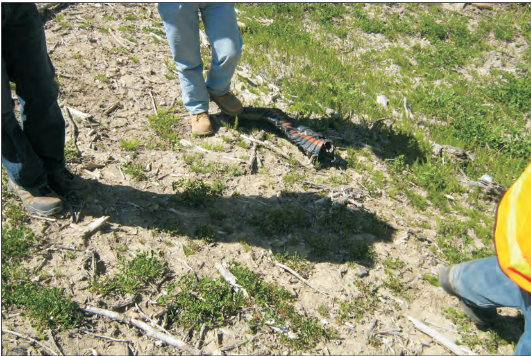
Photo 4 Toe drain located near base of north embankment; was placed during construction of passing lane