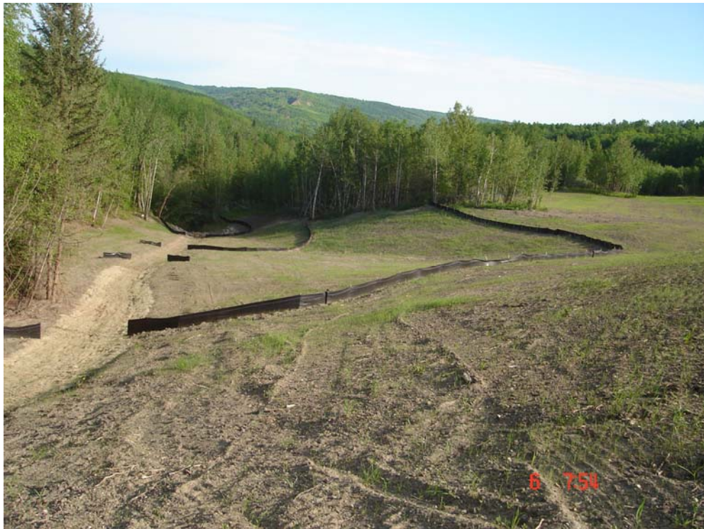
Photo 3 – Earthworks for new culvert installation, looking towards the outlet.