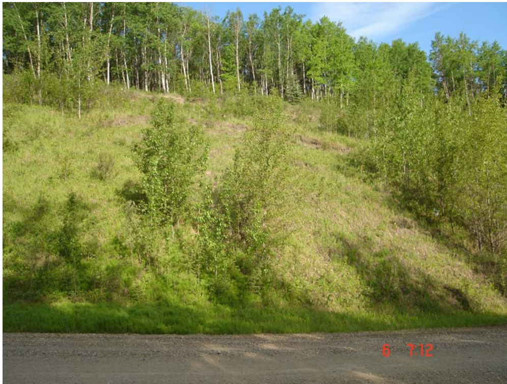
Photo 1 – Shallow slope failures on the south end of the site, looking west.