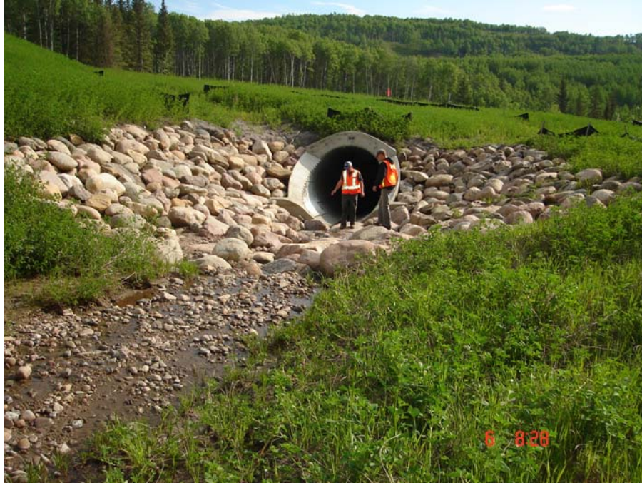
Photo 7 - View of culvert inlet, looking northwest