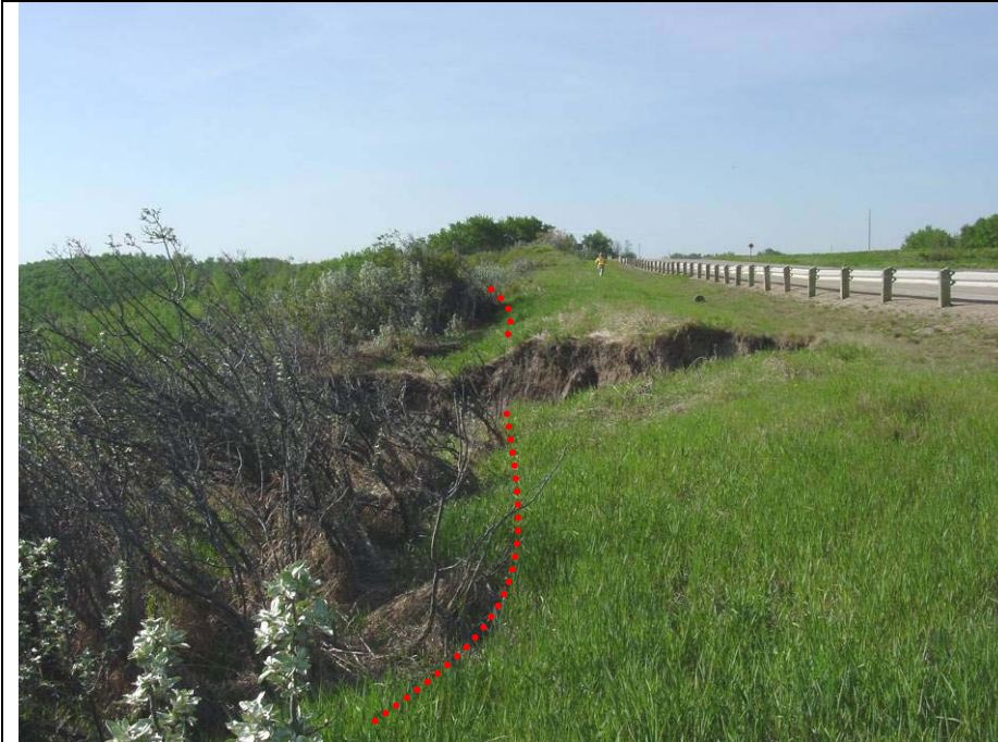
Photo 2. Slide 2 looking south. Note the dip in the slope on either side of the slide – these areas show fresh cracking, suggesting that the slide may expand laterally. Note how close the backscarp is to the pavement, though this distance has not changed since 2006.