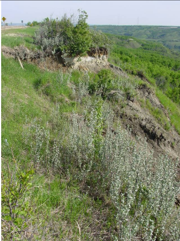
Photo 5. Slide 3 – looking towards the north at the edge of the slide. The steep face appears fresh, but there does not appear to be any significant new movement in the backscarp area.