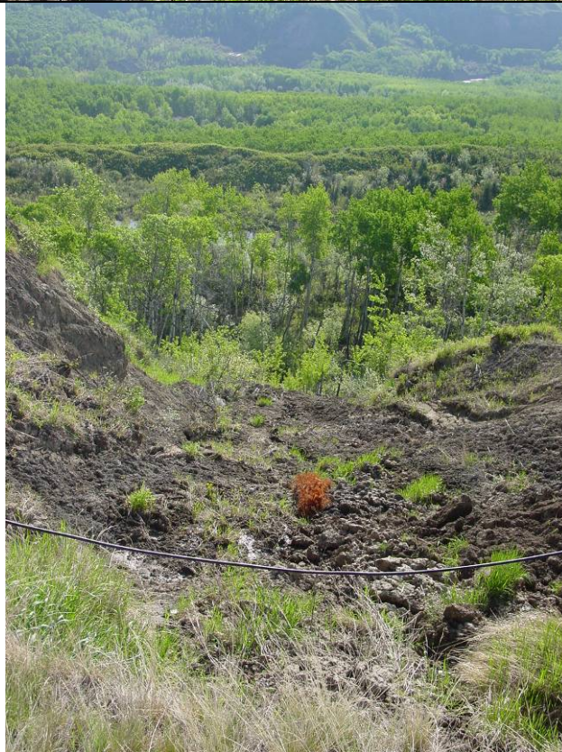
Photo 4. Slide 2 – looking downslope along the slide. Note the fresh material.