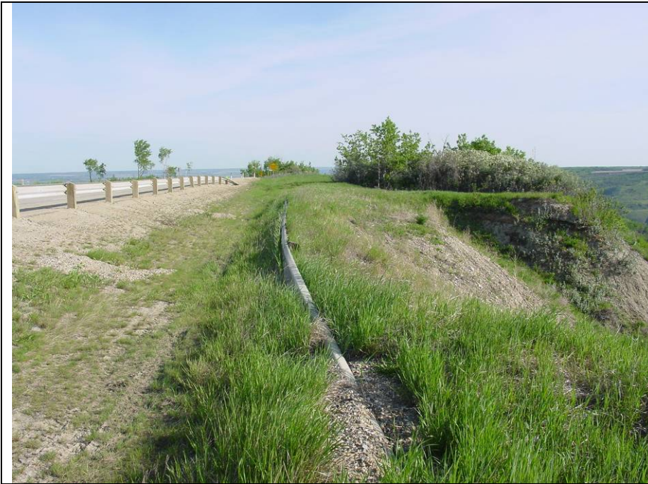
Photo 1. Slide 1 – there is a damp area at the north end of the slide, but otherwise no changes from 2006.