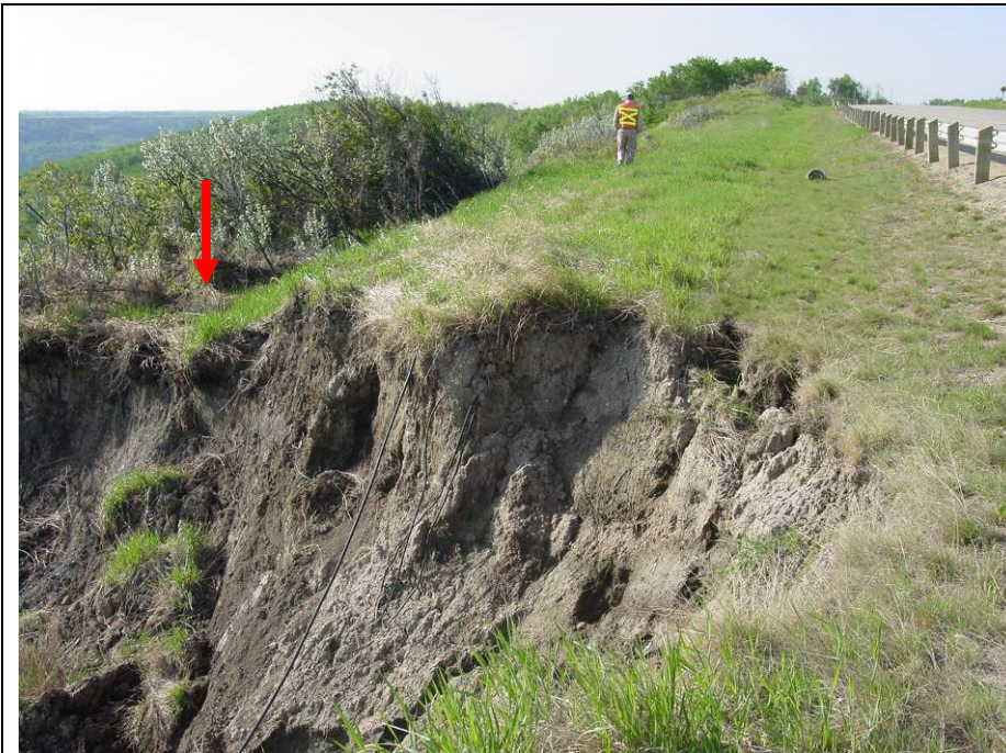
Photo 3. Fresh movement in the backscarp of Slide 2. There is movement and cracking along the break in slope (arrow) suggesting that this block has slumped. This block is expected to move further, and will ultimately widen the slide. A similar feature occurs on the north side.