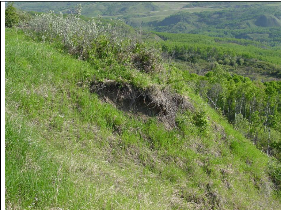
Photo 7. Slide 4 – steep slope at the north side of the backscarp. There is some possible cracking on either side of the slide area, but no fresh movement in the main slide.