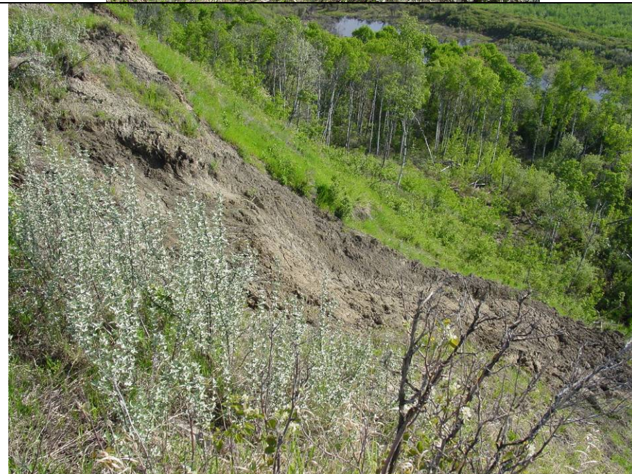
Photo 6. Slide 3 – some fresh soil flows below the backscarp area. Also note the water in the sag pond area below.