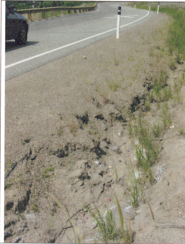
Photo 24. In-slope ditch adjacent to the stone column repair. The geomembrane liner in the ditch appears to have been ripped in places.