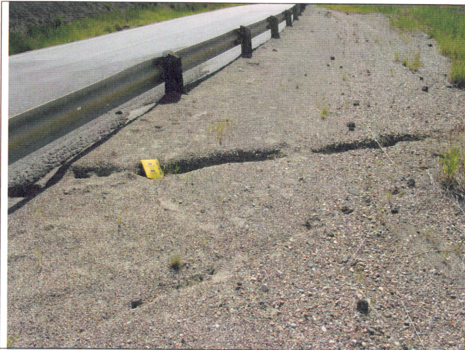
Photo 16. Cracking in the margin of the road at the Makeout Slide. The crack has a roughly 50 mm vertical offset, and is roughly 100 mm wide.