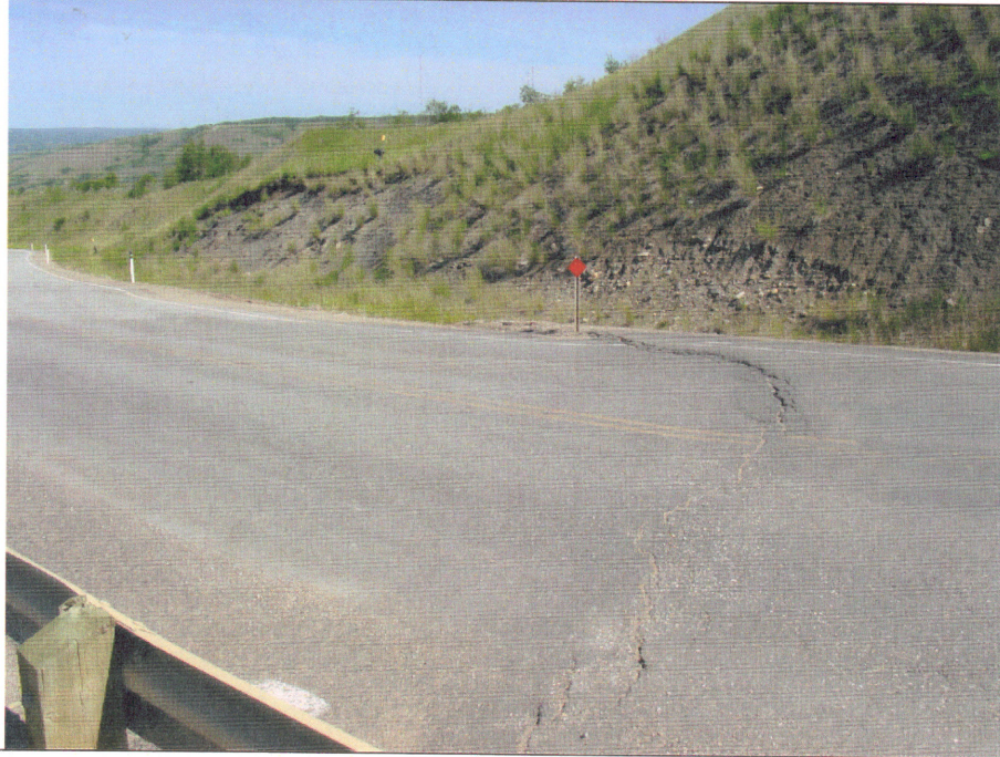
Photo 15. Backscarp of the Makeout Slide. Note the significant cracking and vertical offset in the asphalt.