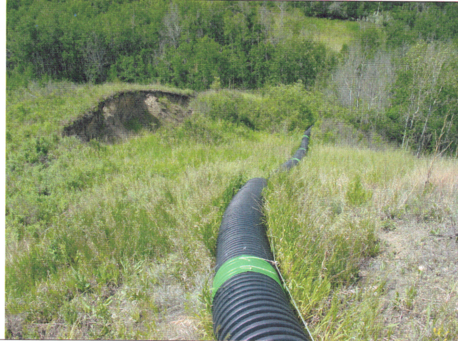
Photo 19. A 450 mm CPP takes drainage from the in-slope ditch down the slope past a previously eroded area. Some of the joints are failed and leaking, requiring repair.