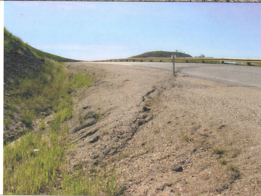
Photo 17. The backscarp cuts across both lanes and enters the upslope ditch. The backscarp is approximately 10 m wide in the ditch. Sandy gravel is exposed locally in the slope above the ditch. There has been past significant flow in the ditch, based on erosion and channel width.