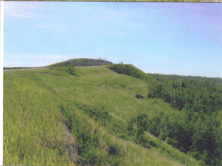
Photo 13. Benches forming stabilisation works for the Michelin Slide.