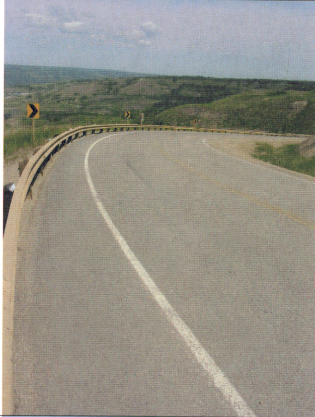
Photo 10. Cracking at the outside of the corner at the south end of the Michelin slide.