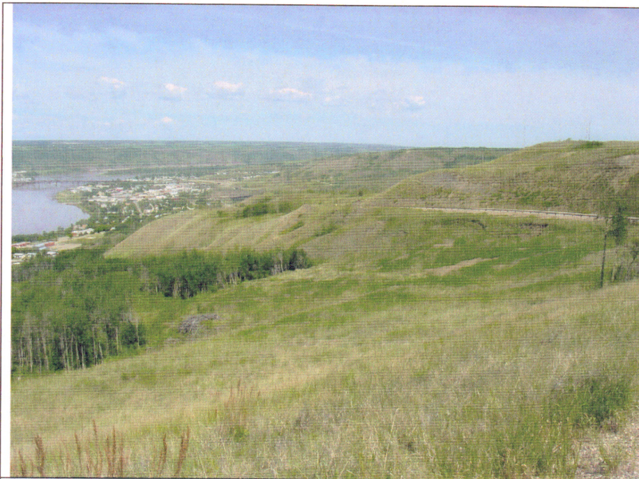
Photo 12. Slide stabilisation work in the runout zone below the Michelin Slide.