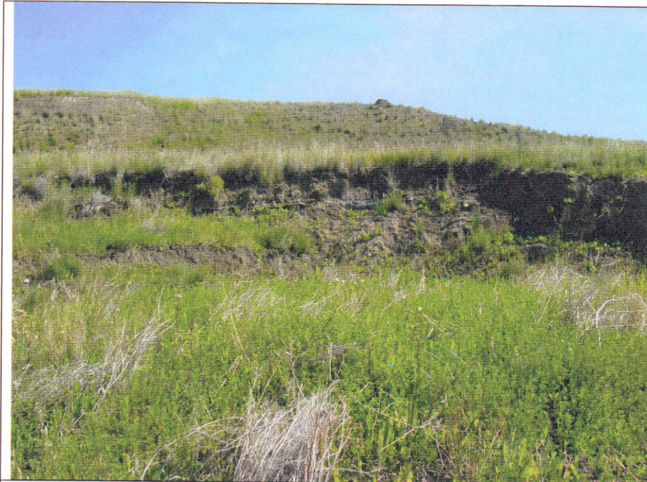
Photo 14. Slump below the road, exposing geotextile in backscarp. Located at approx. 58+000.