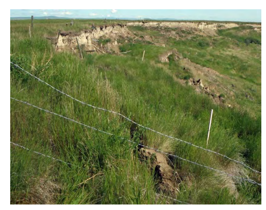
Photo S4-2 (June 2012) -Taken from near the same location as Photo S4-1. Note the displacement of the stake visible in the foreground of the photos, which indicates a retrogression. Continued retrogression at the slope crest, as well as disturbance of the vegetation by soil flows has occurred. Overall the slope appears more vegetated and stable than previous years.

Facing north across the soil nail repair area in 2011, for comparison with 2012 conditions (refer to Photo S4-2).