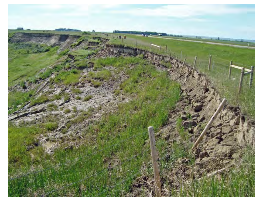
Photo S4-3 (June 2012) – Facing south at the slide area. The instabilities in the upper, steeper portions of the slope are mostly unchanged from 2011 apart from settlement of the larger blocks. Retrogression of the slide continues to occur with large blocks sliding down and adding to the slide mass although at a seemingly slower rate than observed previously.