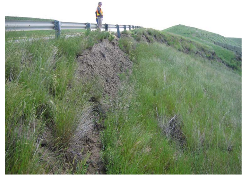
Photo S5-2 (upper right) – June 2005 – undermined segment of guardrail, as it appeared during the June 2005 inspection.