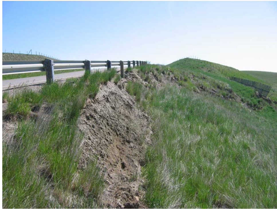
Photo S5-1 (upper left) – May 2006 – facing east across the shallow slumping area that is undermining the guardrail along the downslope edge of the road. Compare with Photo S5-2 that shows the same area as it appeared during the June 2005 inspection.