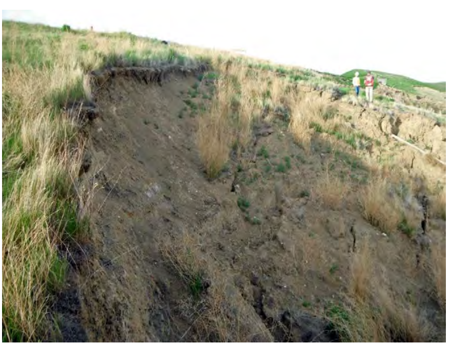
Photo S5-5 (May 2013) – Looking towards the same slide area as Photo S5-4. The exposed soil has eroded but the condition is generally unchanged.