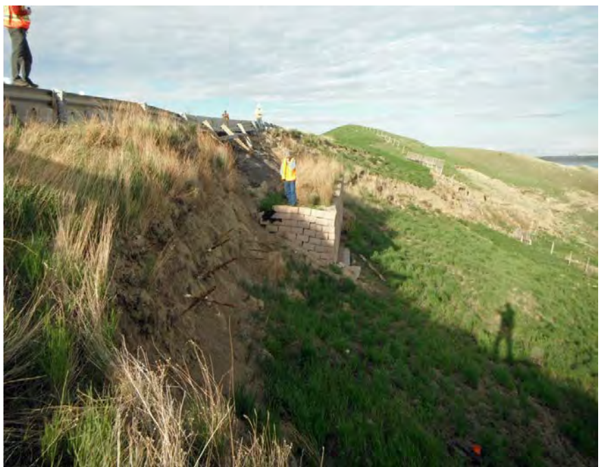
Photo S5-1 (May 2013) – A general view of the site area facing towards the east, illustrating the extent of the wall settlement, undermined guardrail and the exposed soil nails.