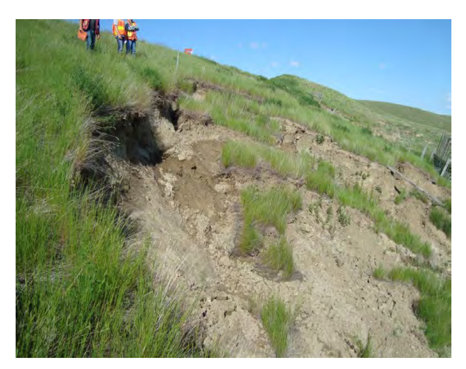
Photo S5-4 (June 2011) – An active scarp at the west slide flank noted during the 2011 inspection. Refer to Photo S5-5 for comparison from the 2013 inspection.