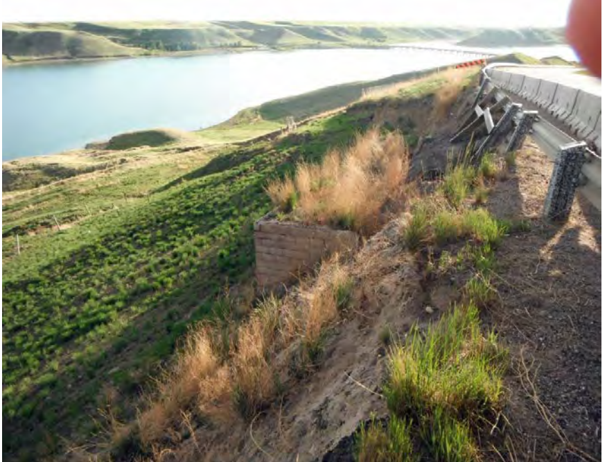
Photo S5-3 (May 2013) – Standing on the south road shoulder looking towards the southwest at the headscarp retrogression into the road surface and retaining wall.