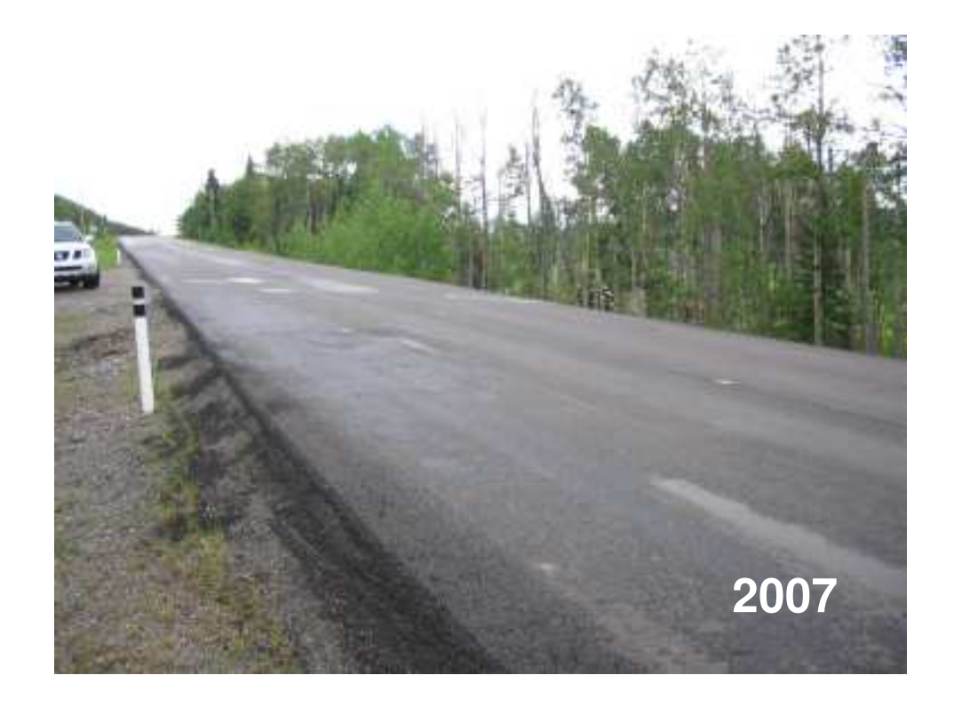
Photo S10(A)-4 – June 2007 (lower right) Another view facing south across the site.

Photo S10(A)-3 – June 2007 (lower left) Facing south across the site.