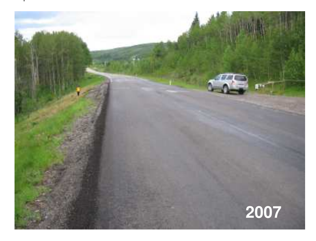
Photo S10(A)-1 – June 2007 (upper left) Facing north across the site. The recent overlay has obscured any recent cracking and settlement in the road surface. See Photo S10(A)-2 for a view of the site as it appeared during the 2005 inspection.