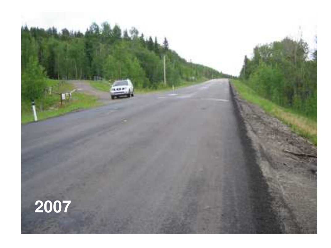
Photo S10(A)-3 – June 2007 (lower left) Facing south across the site.

Photo S10(A)-4 – June 2007 (lower right) Another view facing south across the site.