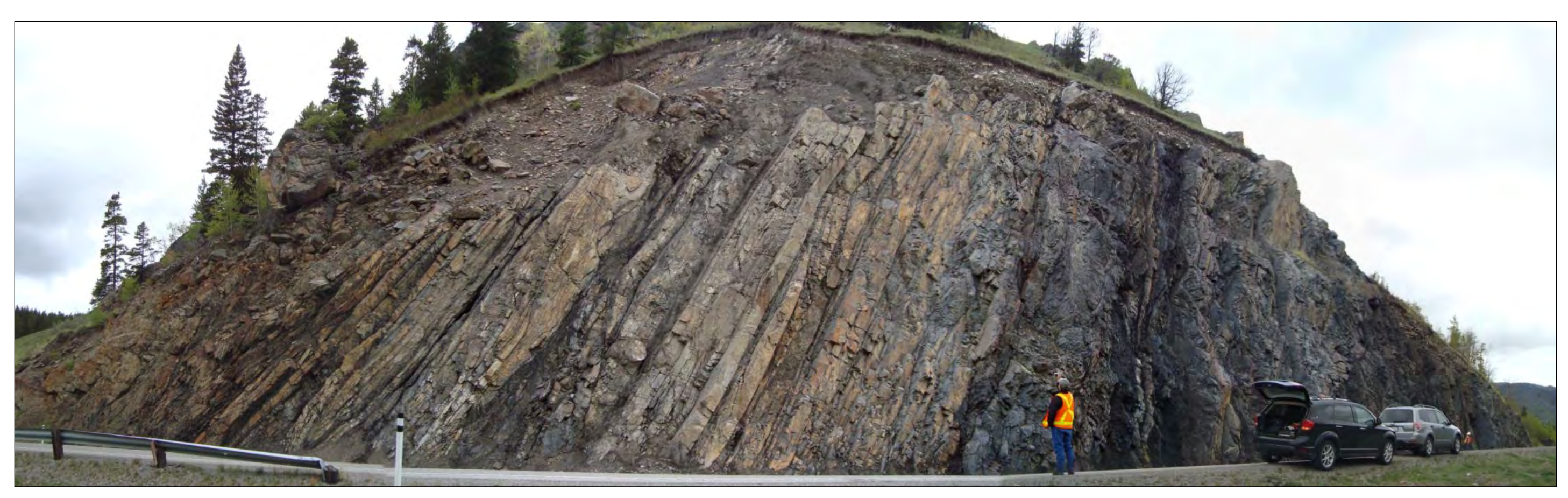
Photograph S20-1 – May 2013 Stitched photographs of cut slope taken from south side of the highway. Image is slightly distorted horizontally due to image processing.