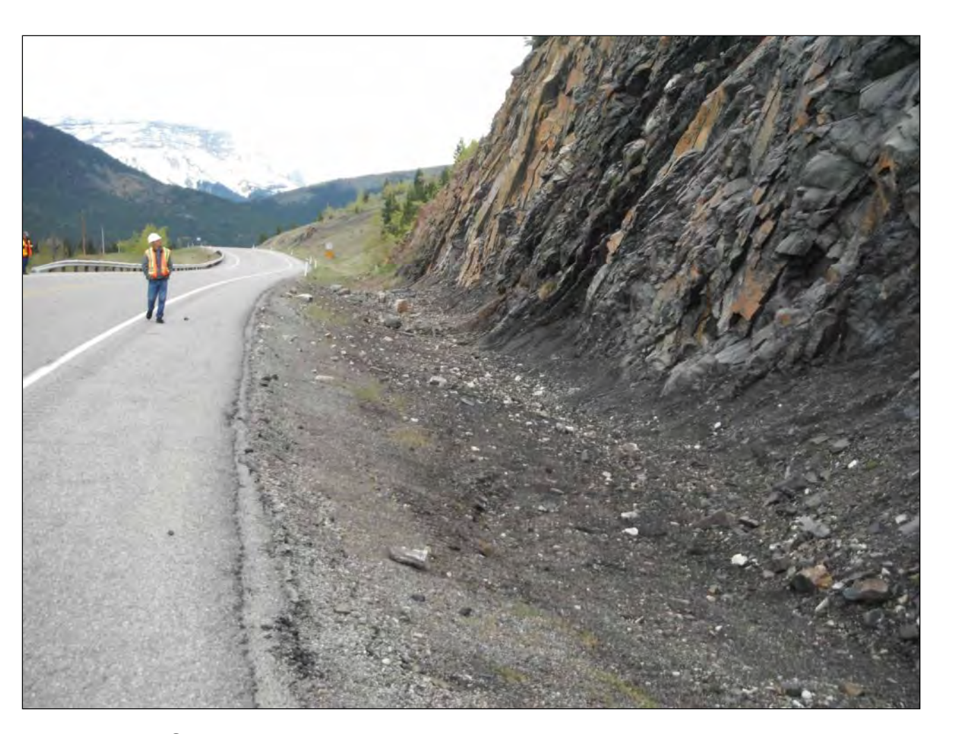
Photograph S20-3 – May 2013

Looking eastbound along the north ditch. Rock fall includes gravel to cobble sized rocks, with gravel on the paved shoulder and cobbles immediately adjacent to the paved surface. Boulder sized rocks are also present in the ditch.