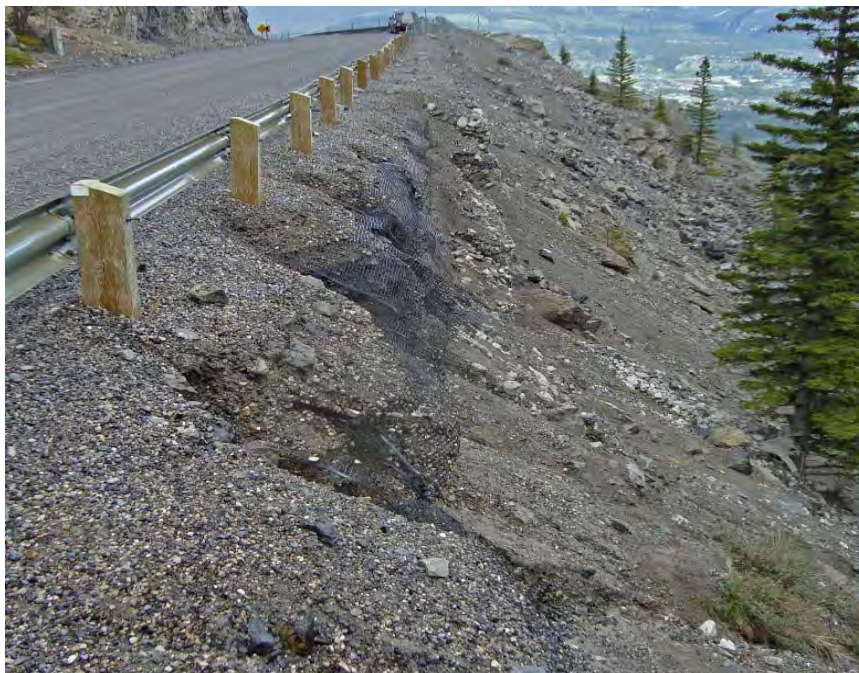
Photo S30-4 – June 2012 Gullying and surface erosion along the downslope edge of the highway, above the collapsed segment of the wall. The geogrid within the road embankment continues to support the highway, but the loss of erosion protection provided by the gabion wall has allowed surface erosion to continue and retrogress back to the edge of the guardrail since the 2008 inspection.