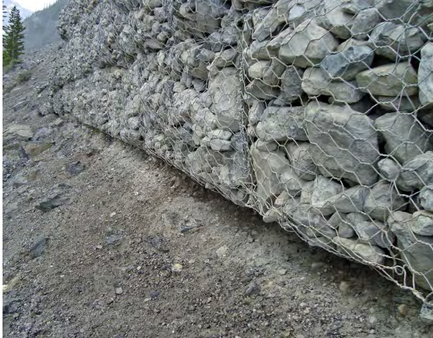
Photo S30-3 – June 2012 Undermining at the base of the eastern end of the gabion wall. There was no flow at the time of the site inspection. The undermining has expanded considerably since 2008.