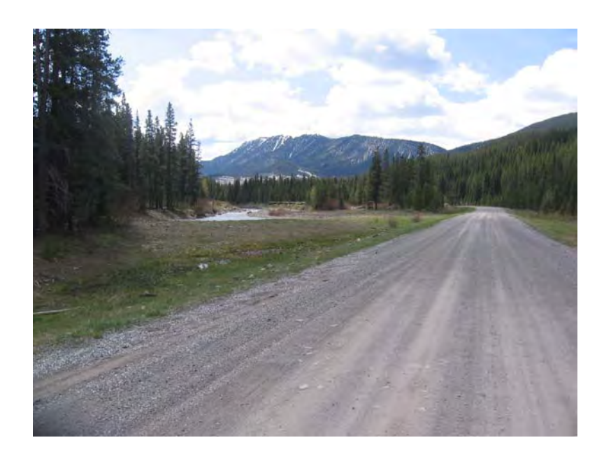
Photo 2 – June10, 2009 (top) Facing southbound along Highway 940 from the bridge location, and also facing upstream along the Wilkinson Creek channel (visible in the left background)