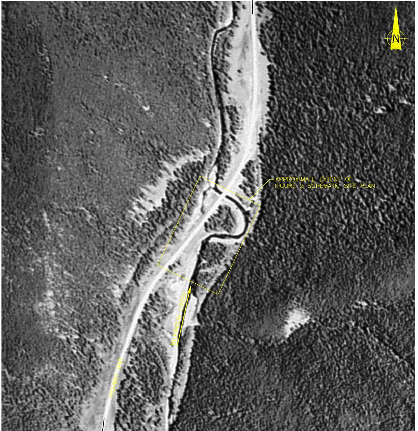
ORIGINAL AIR PHOTO: PROVINCE OF ALBERTA, 99-091, 1:20,000, 99-07-28, AP 82J LN-5 AS5054-68.