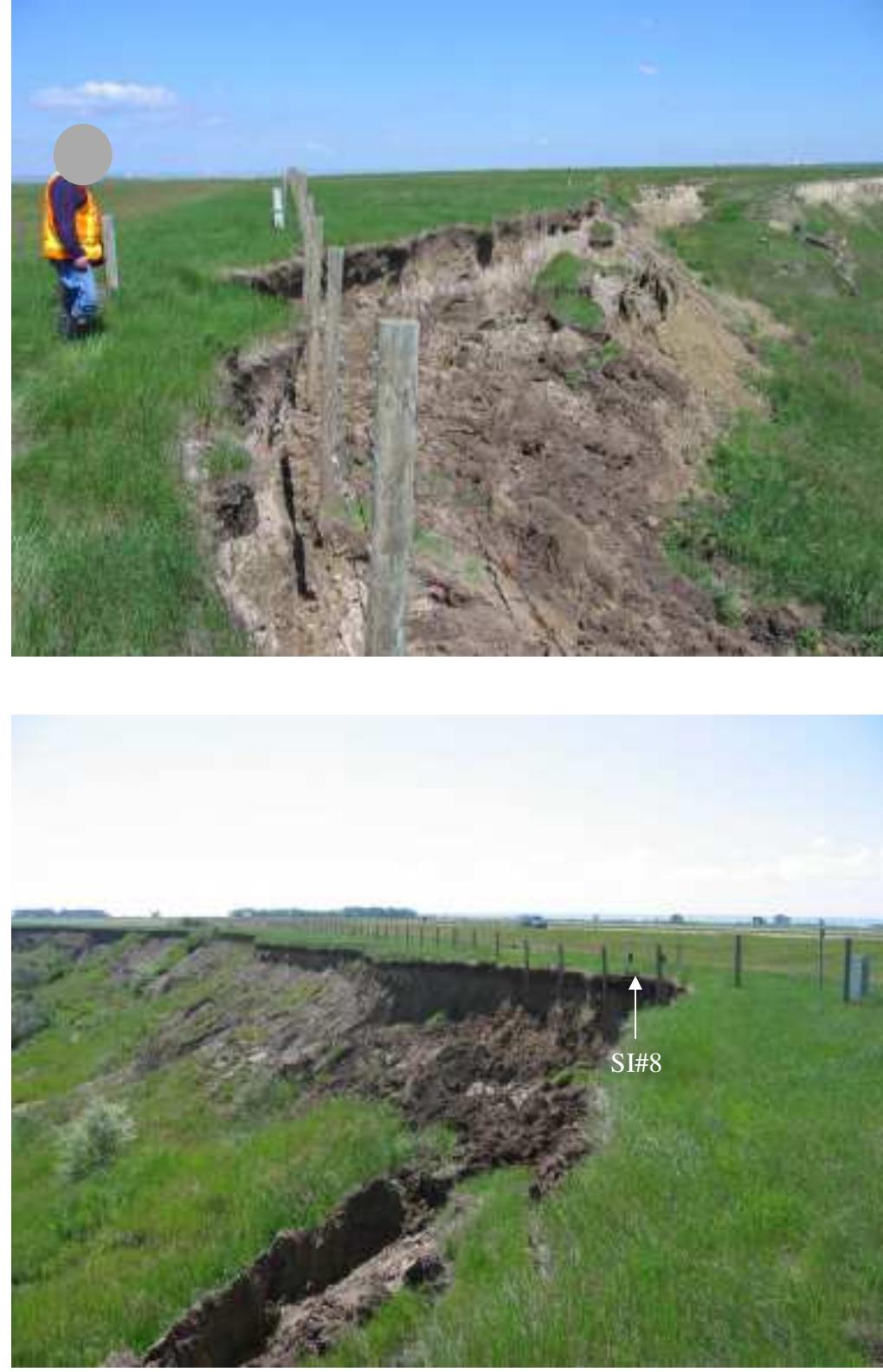
Photo S4-4 (lower right) – June 2005 – wider view of recent scarp retrogression shown in Photos S4-2 and S4-3. The fresh appearance of the exposed soil in the scarp indicates that the retrogression occurred in mid to late June 2005, likely due to heavy rains.

Photo S4-3 (lower left) – June 2005 – facing south across the area where the landslide scarp has retrogressed across the fenceline since the 2004 inspection.