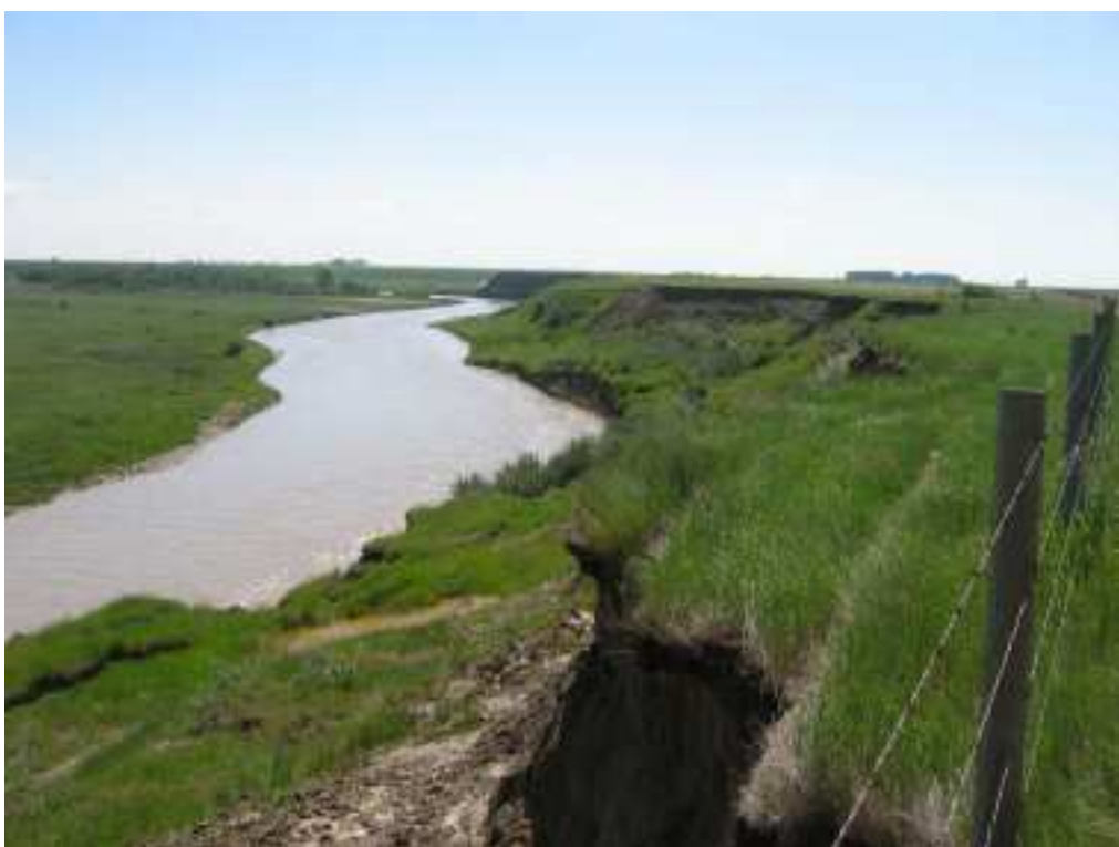
Photo S4-1 (upper left) – June 2005 – facing south across the landslide area from near SI#8.