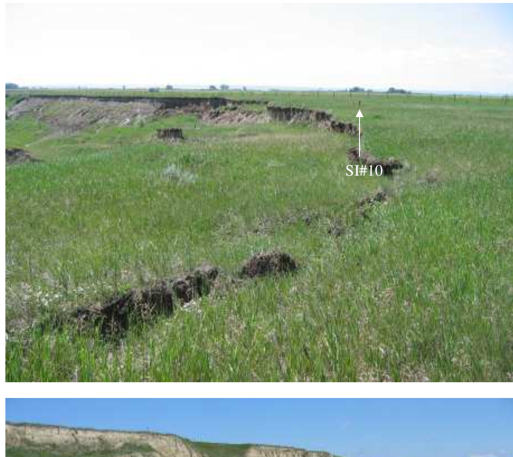
Photo S4-5 (upper left) – June 2005 – recent downdrop of landslide block along the northern flank of the landslide area.

Photo S4-6 (lower left) – June 2005 – looking upstream at scarp that has formed above creek level. Recent toe erosion in central portion of landslide area due to high creek levels following heavy rains in June 2005.