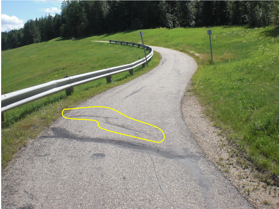
Photo 7: Crack in paved trail above bin wall reflecting through seal.