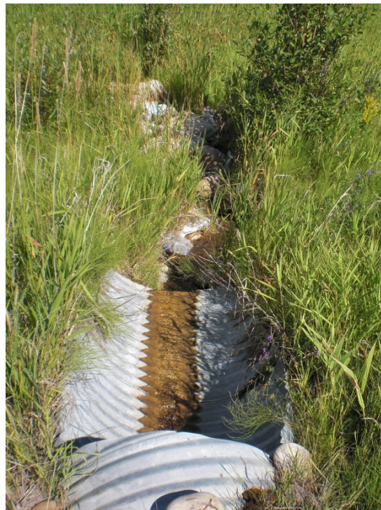
Photo 6: Debris collecting at culvert outlet at approximately station 1+600.