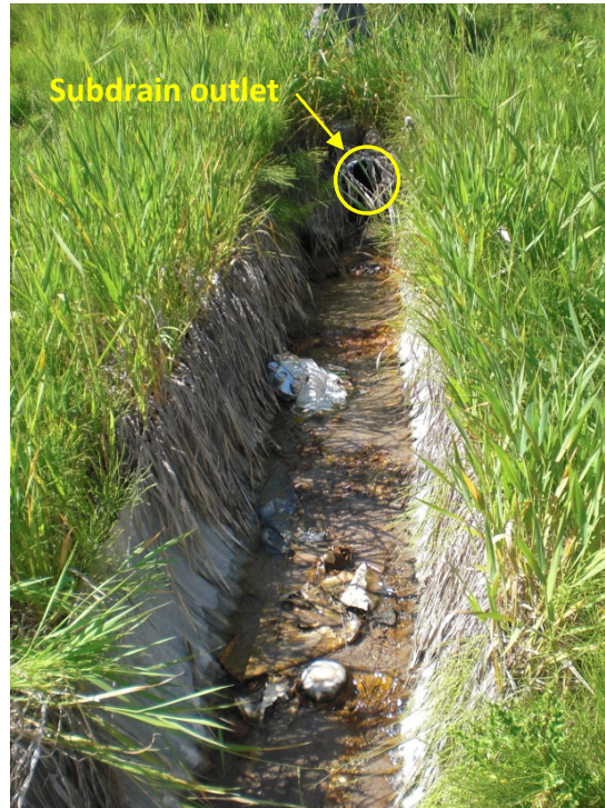
Photo 5: Subdrain outlet and debris accumulation in half-round culvert.