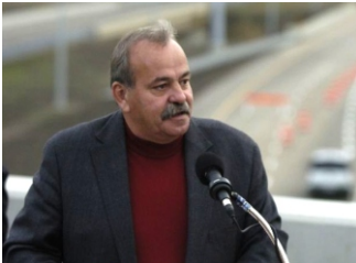
Honourable Luke Ouellette, Minister of Infrastructure and Transportation

The 3-Year Traffic Safety Action Plan (TSP) has been approved by the Honourable Luke Ouellette, Minister of Infrastructure and Transportation. Minister Ouellette will be sharing this plan with his colleagues.