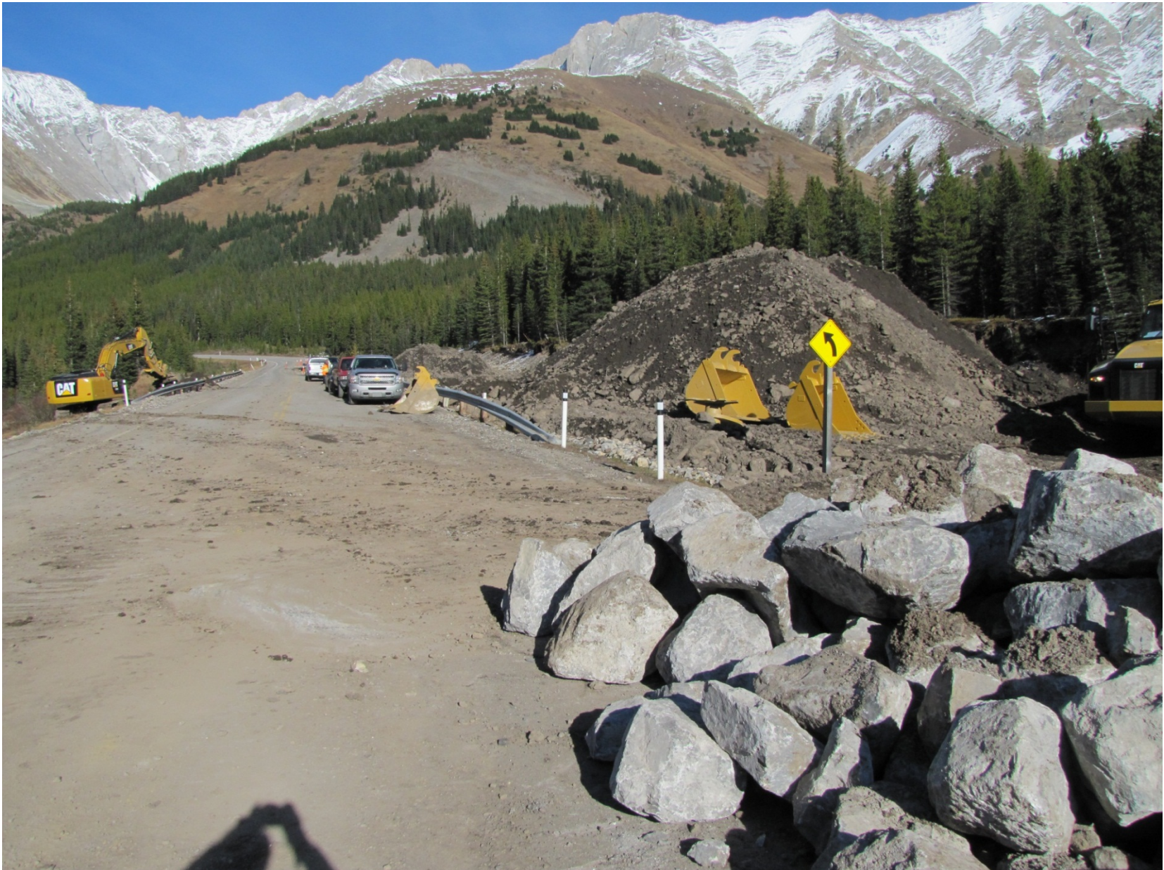
Highway 40, repair work at Storm Creek site where debris from mountain run off plugged culverts and washed road and ditches away.