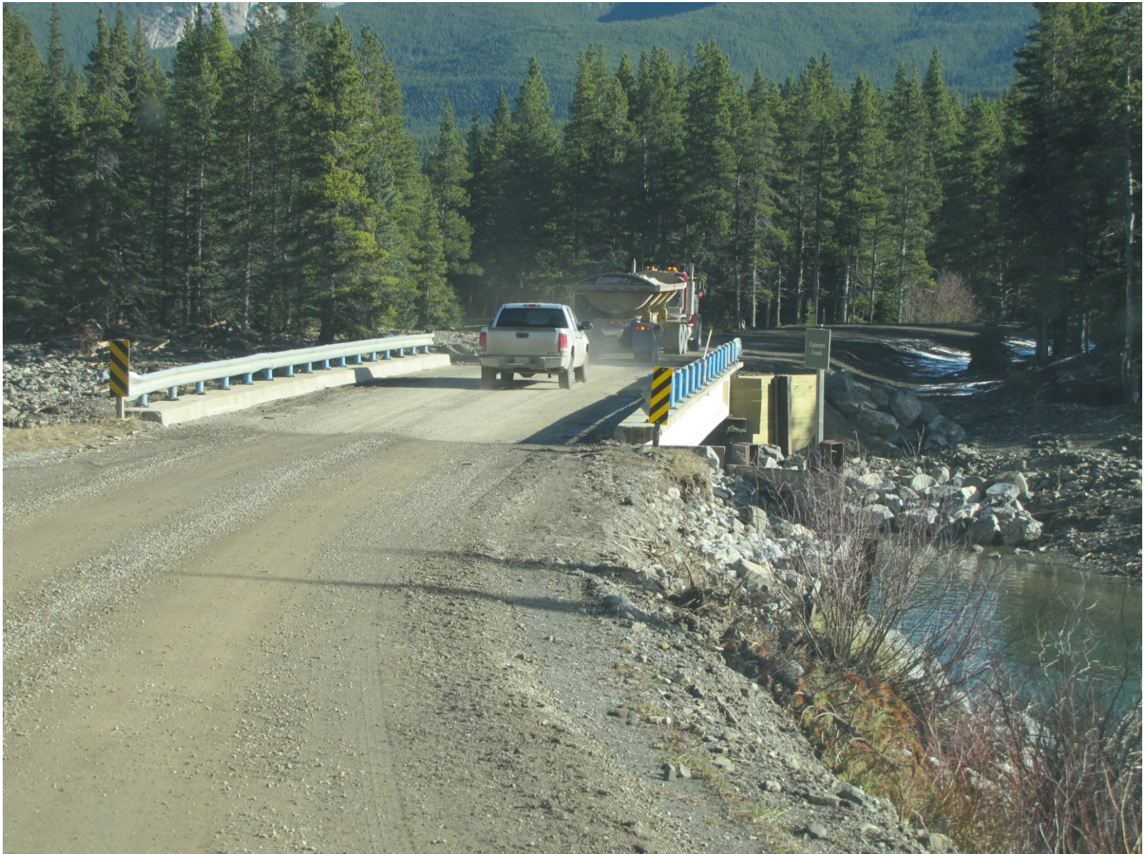
Forestry Trunk Road bridge approach back filled and repaired for traffic to drive on. Creek has been restored to its original course.