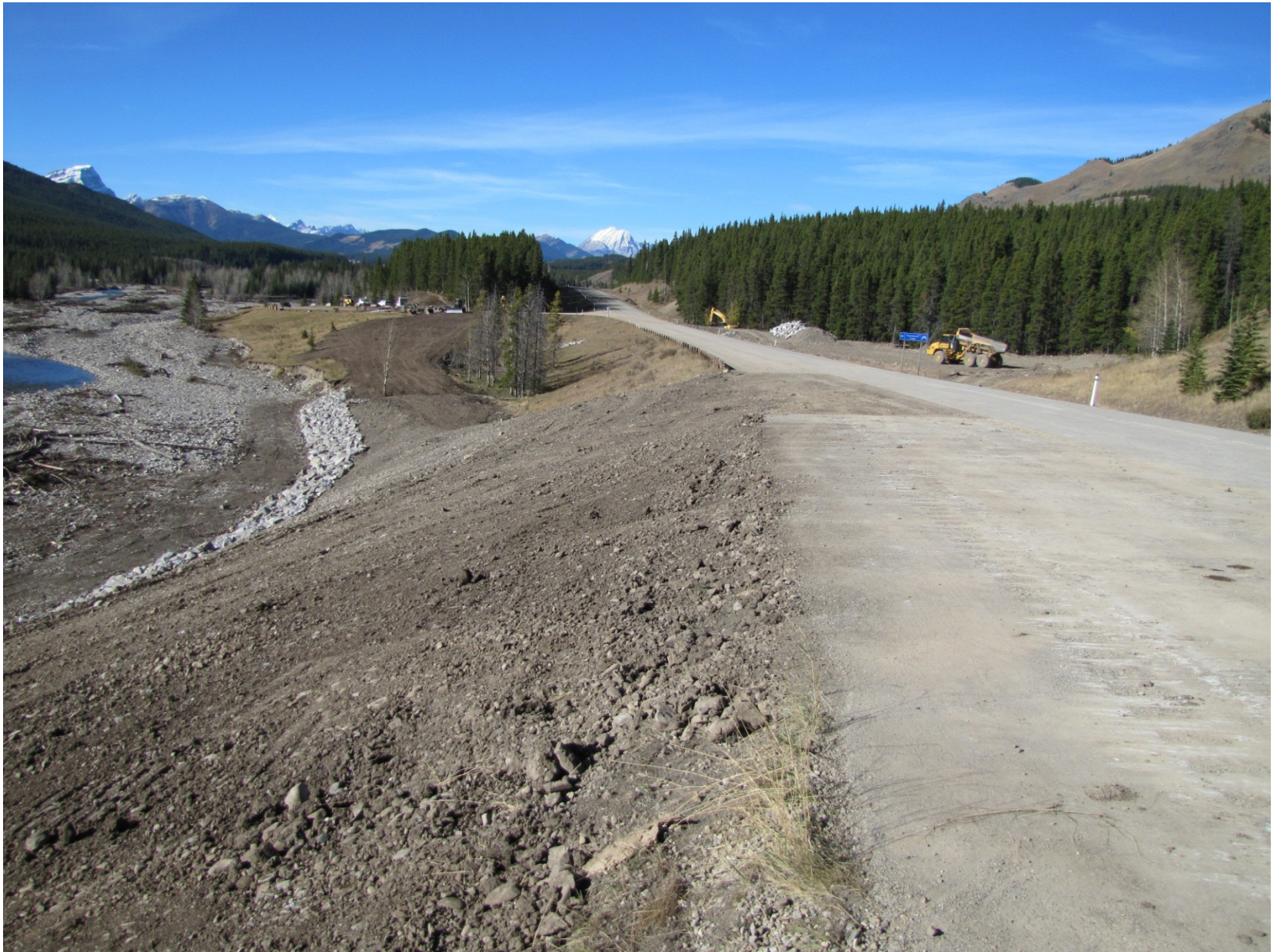
Highway 40 washout repair with a new gravel road surface and slideslope repaired.