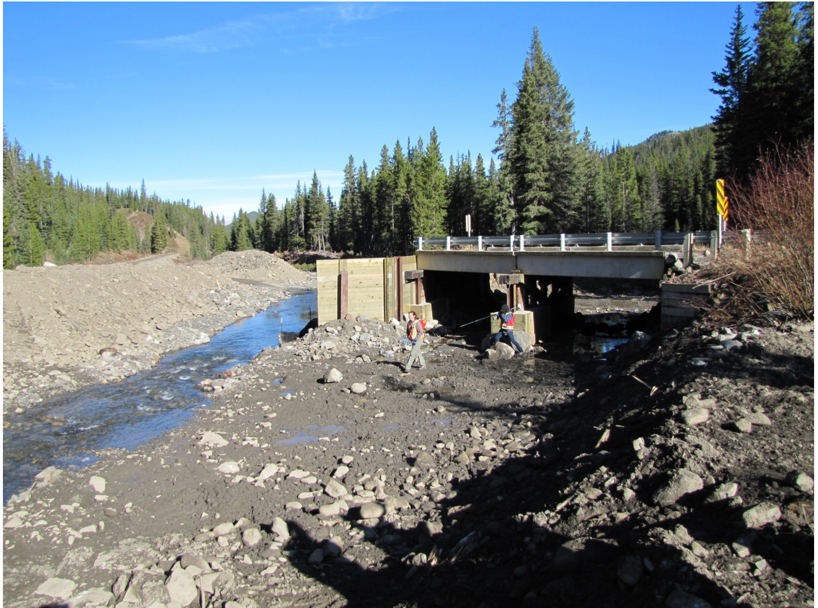
Forestry Trunk Road bridge approach washed out. Note creek has created a new channel which needs to be re-directed under the bridge.