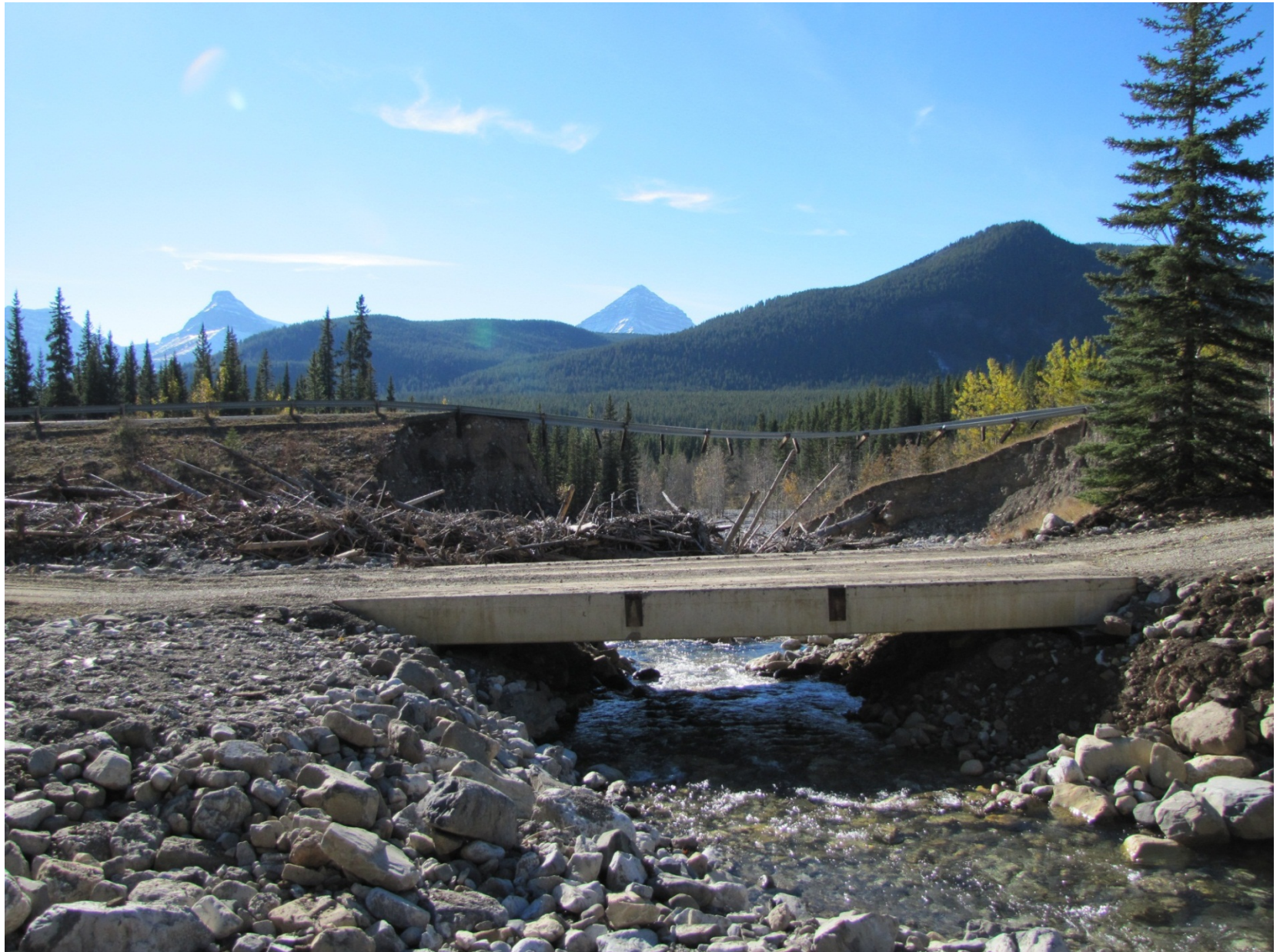
Highway 40, temporary bridge detour at Lineham Creek. Note damaged road and missing culvert location in background.