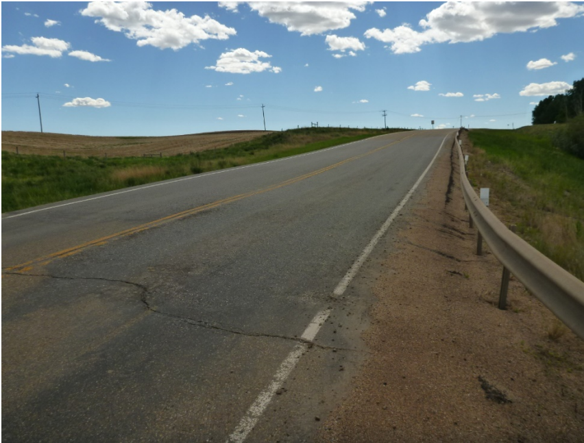
Photo 2 View of the pavement patch that was taken during the 2017 inspection. Photo taken June 13, 2017 looking southwest.