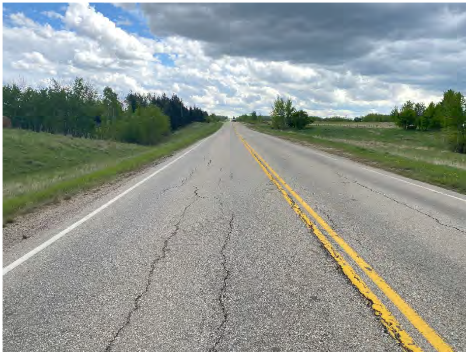
Photo 4: Longitudinal cracks in front of farm access at north limits of site. Looking south.