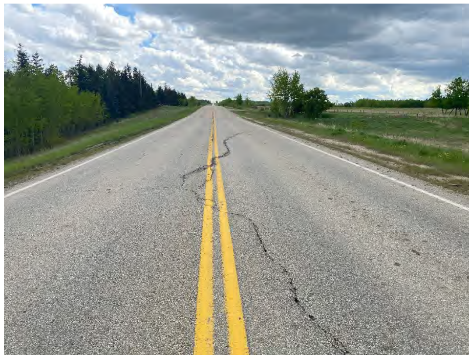
Photo 2: Approximately midway of semi-circular crack near SI-1R. Looking south.