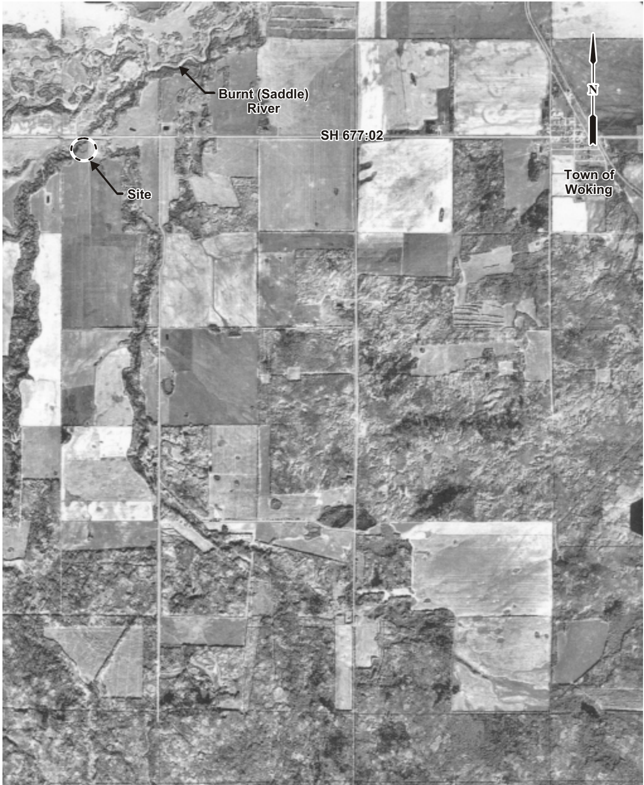
Based on 1995 Aerial Photograph