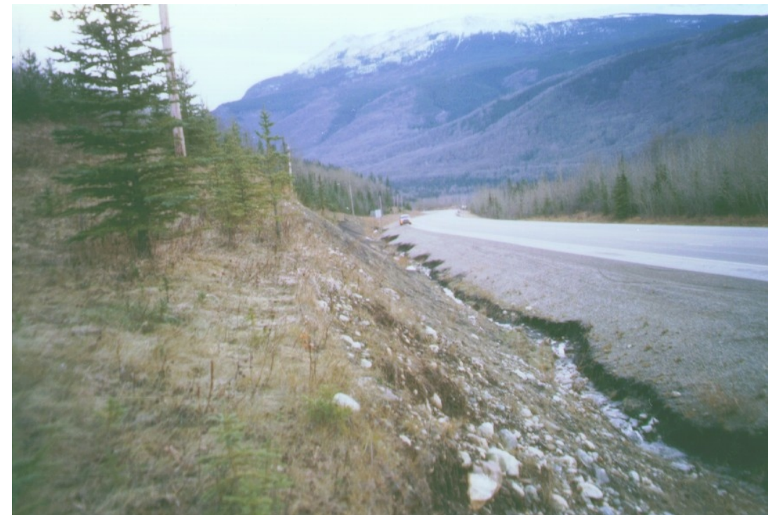
Photo 16 Looking north - steep erosion scarp of highway ditch subgrade will be a safety concern.