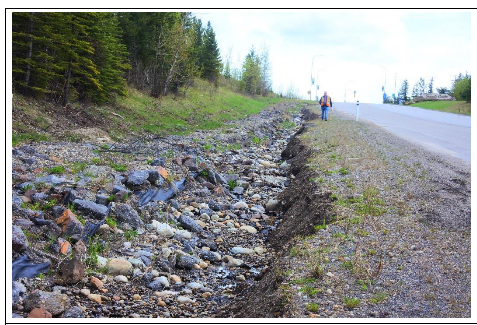
Photo 3. Looking south at a runoff erosion gully that enters the east highway ditch near the north end which has eroded the ditch