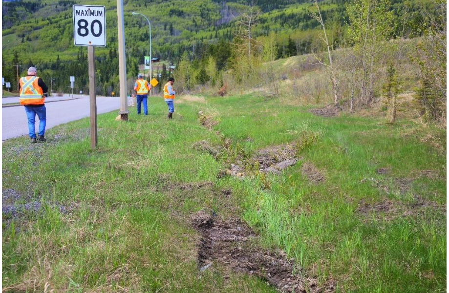
Photo 10. Looking north from the beginning of the erosion gully in the grassed ditch (near the south end).