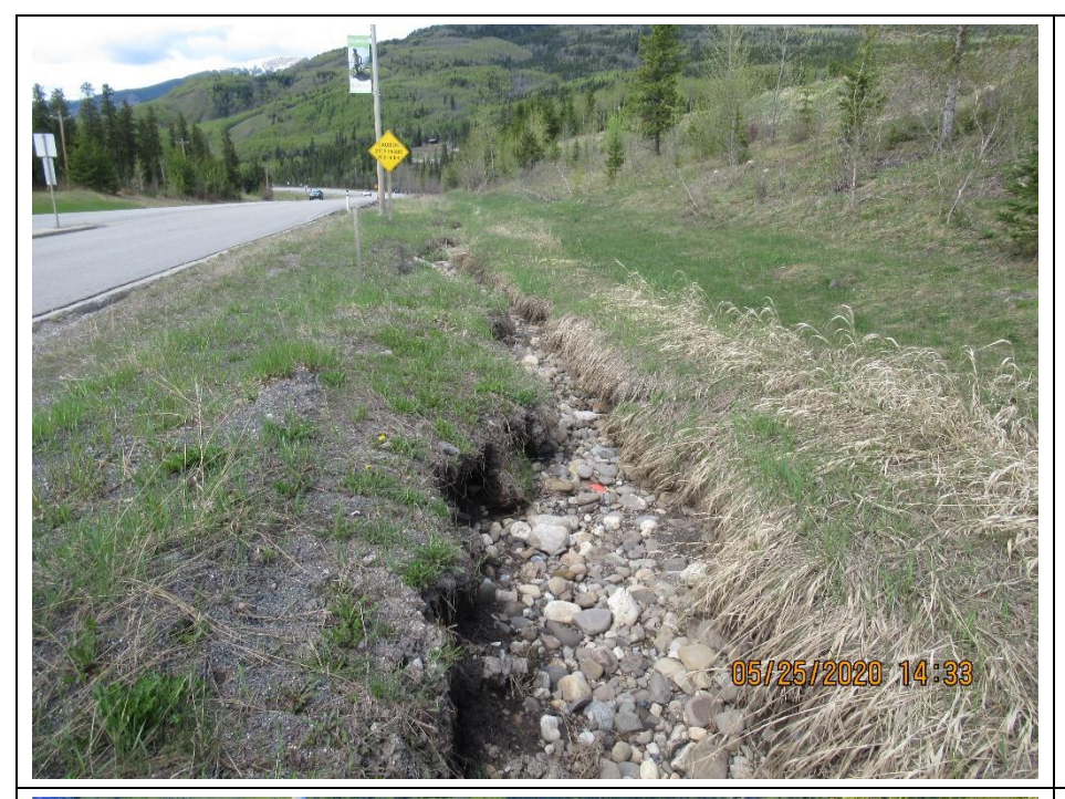
Photo 9. Looking north along the erosion gully formed in a grassed ditch, south of where the riprap starts.