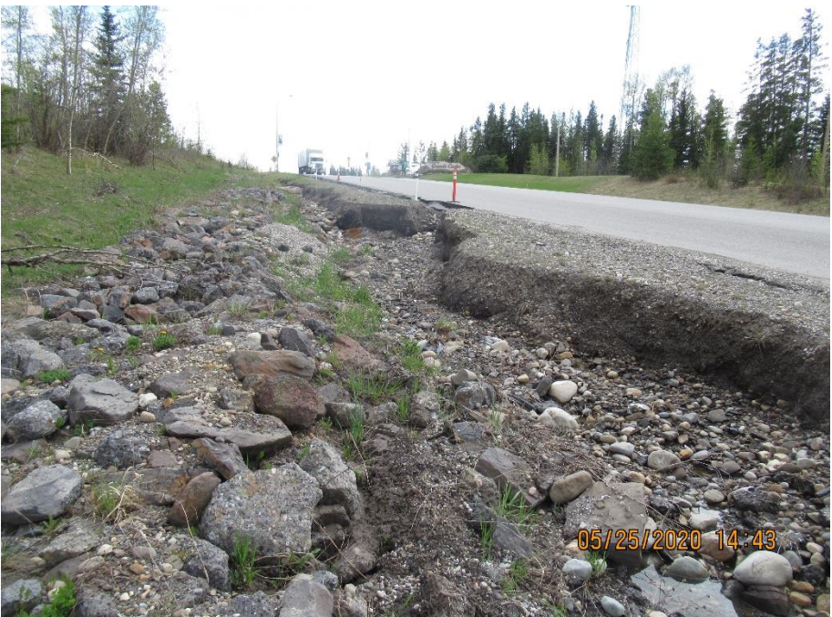
Photo 4. Looking south where deepest portion of the erosion gully in the east ditch is and is now encroaching into the roadway.