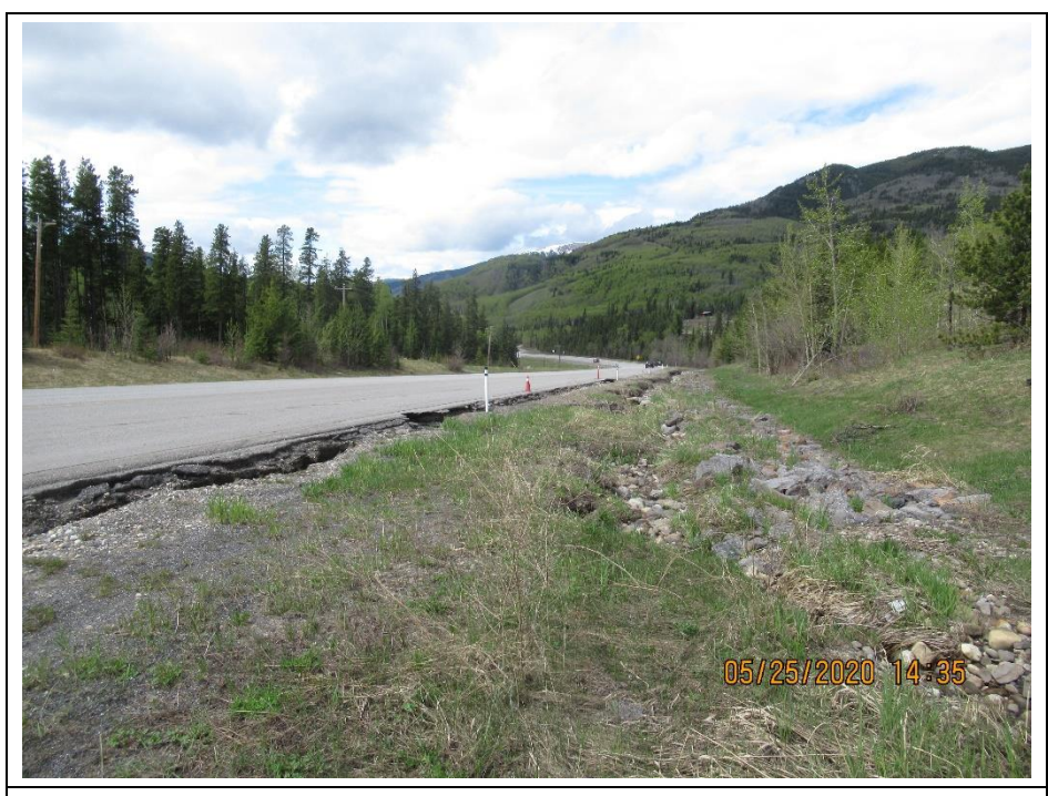
Photo 7. Looking north along the erosion gully from the start of the riprap in the east ditch.