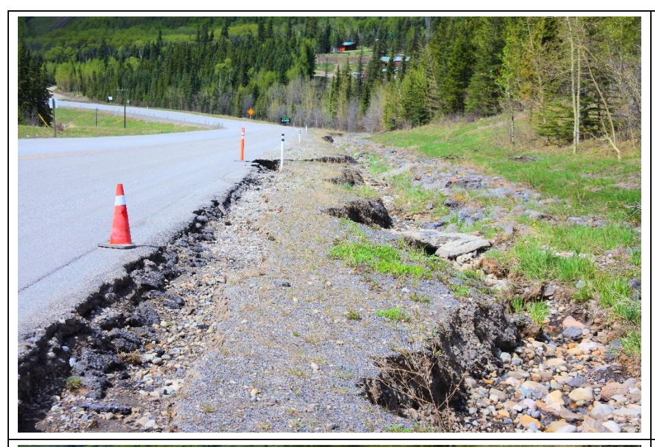
Photo 5. Looking north along the erosion gully further south where the erosion is up to 1.2 m deep and cutting into the highway now.