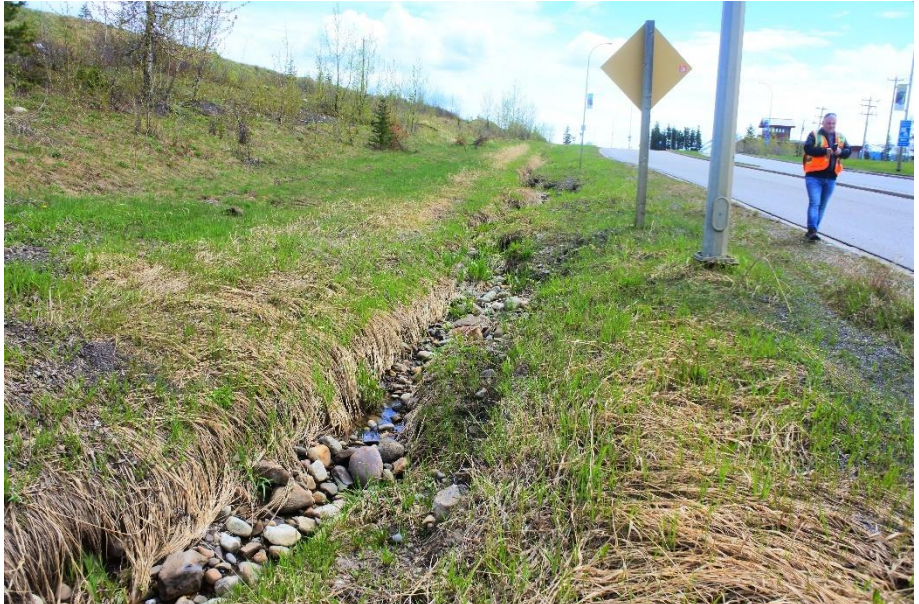
Photo 8. Looking south along the erosion gully just south of where the rip rap lined channel starts.