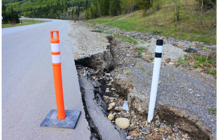
Photo 6. Looking north along the erosion gully where the erosion has gotten closer to the roadway.