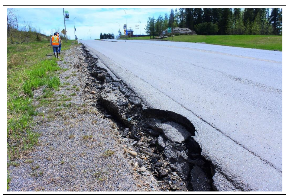
Photo 11. Looking south at new erosion that runs near highway pavement.