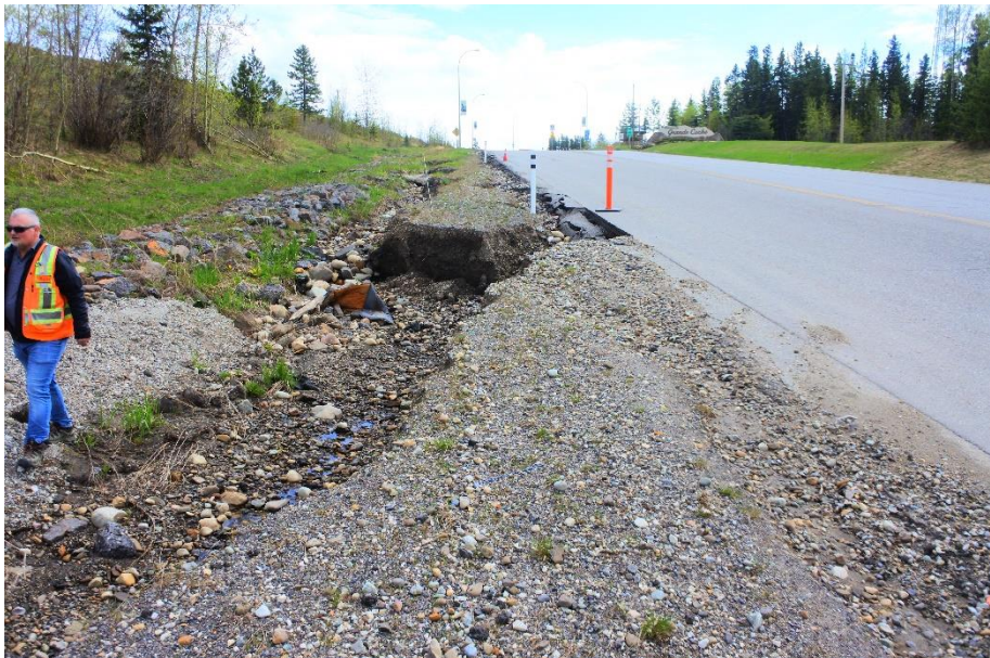
Photo 12. Looking south where a second channel of erosion exists and has cut into the roadway.