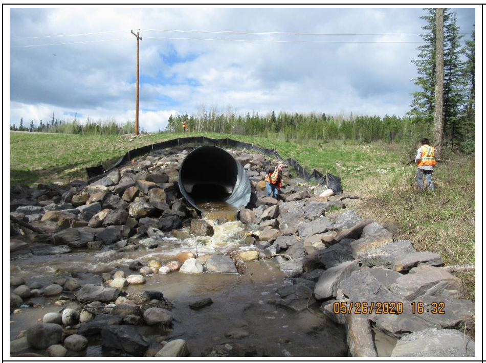
Photo 3. Looking north at the 2.43 m diameter SPCSP outlet and riprap.