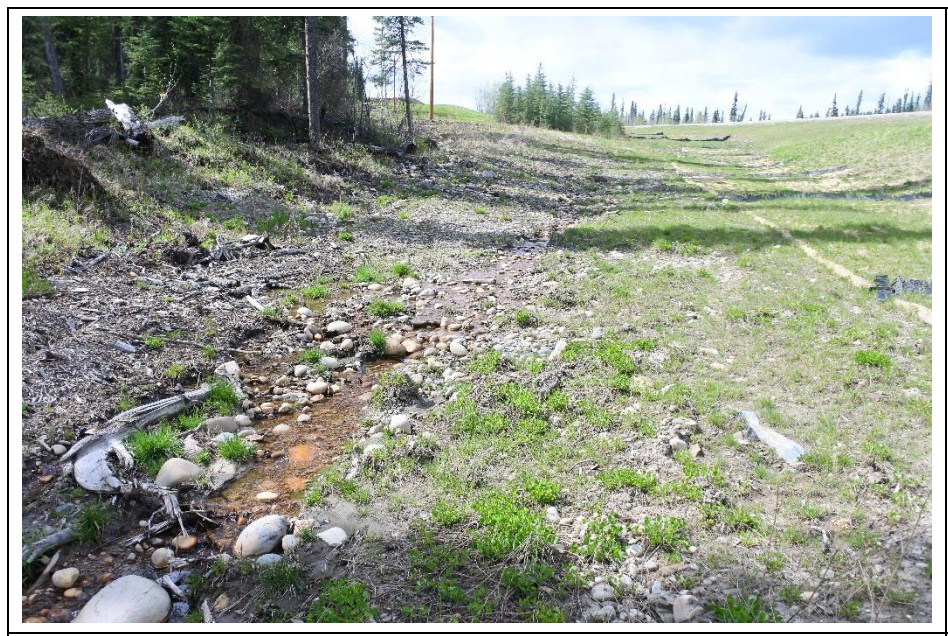
Photo 7. Looking northwest towards swale where there are several springs and ground seepage runs parallel to outside west edge of swale.