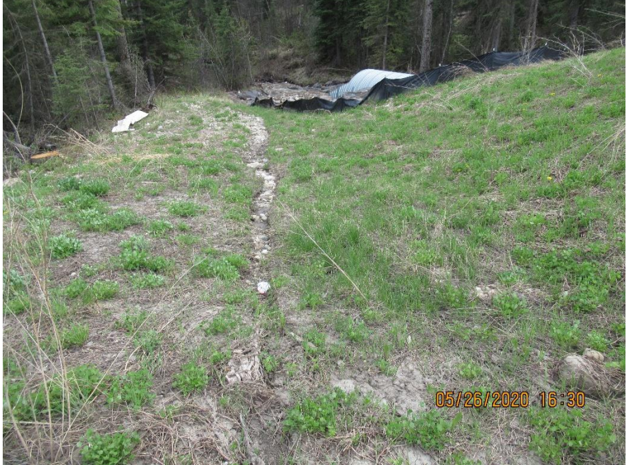
Photo 6. Looking southwest at where minor erosion has occurred beneath coconut matting.