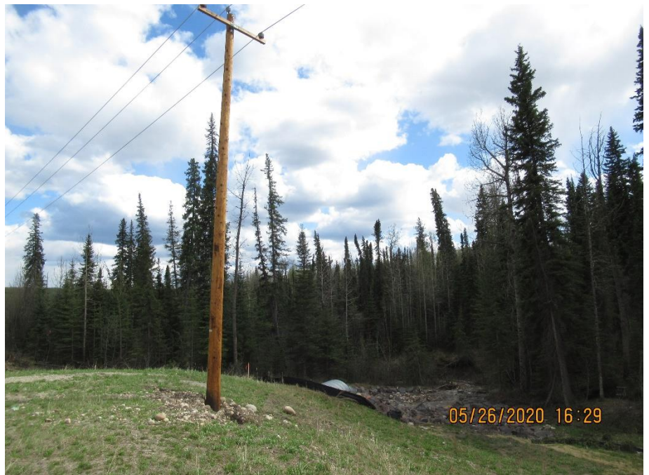
Photo 10. Looking southeast at new power pole that was installed on toe berm near culvert alignment.