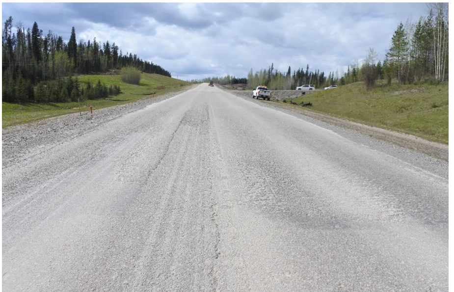
Photo 4. Looking north along the highway at where patch had been placed.