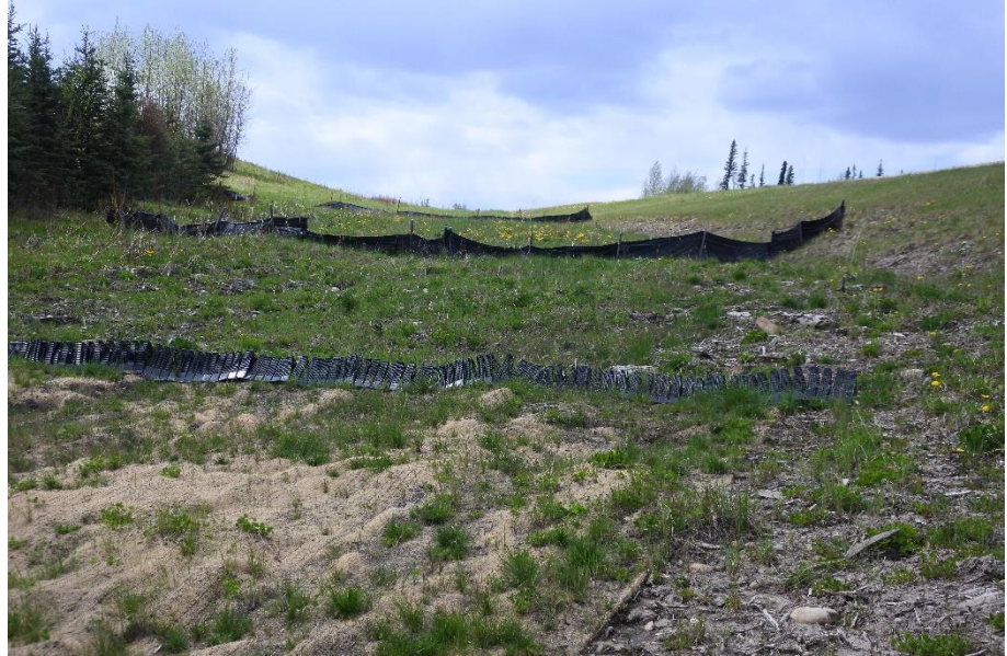
Photo 2. Looking north along the west ditch at erosion control soil covering and silt fencing.