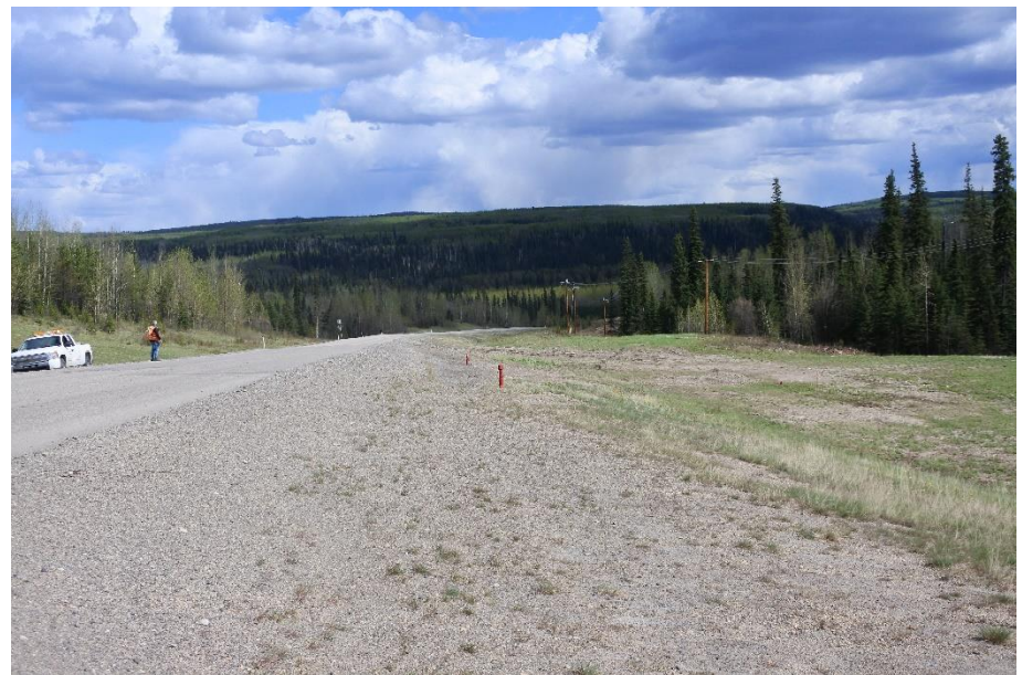
Photo 8. Looking southeast along the highway SBL towards the buried 2.43 m diameter SPCSP culvert.