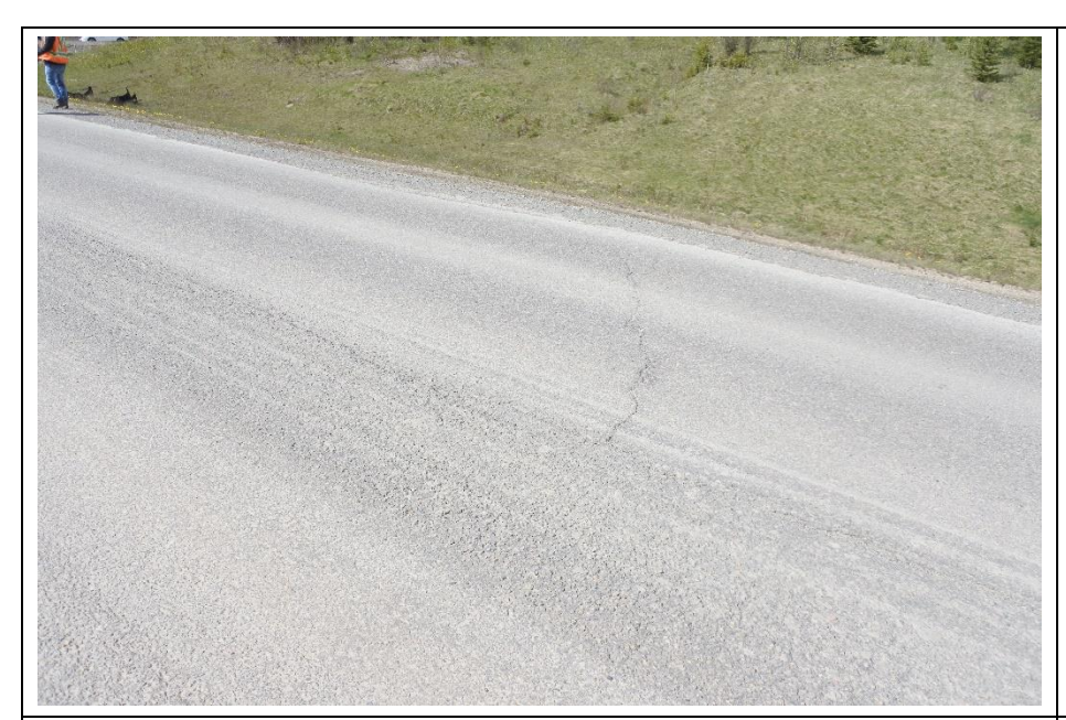
Photo 9. Looking north at diagonal crack that has reflected through the new asphalt patch.