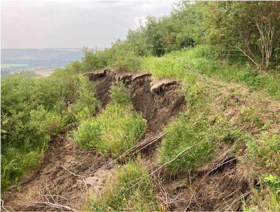
Photo 4 A new slide approximately 100 m long, on the east side of the original slides. Photo taken July 19, 2021 facing east.