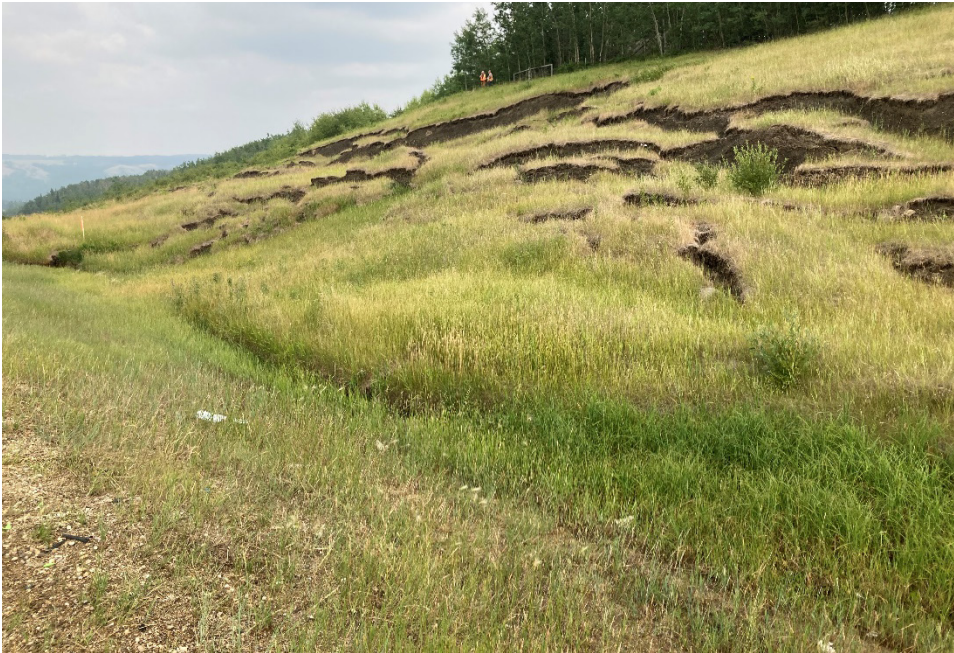
Photo 2 The toe of the slide is blocking the south (eastbound) ditch. Photo taken July 19, 2021 facing east.