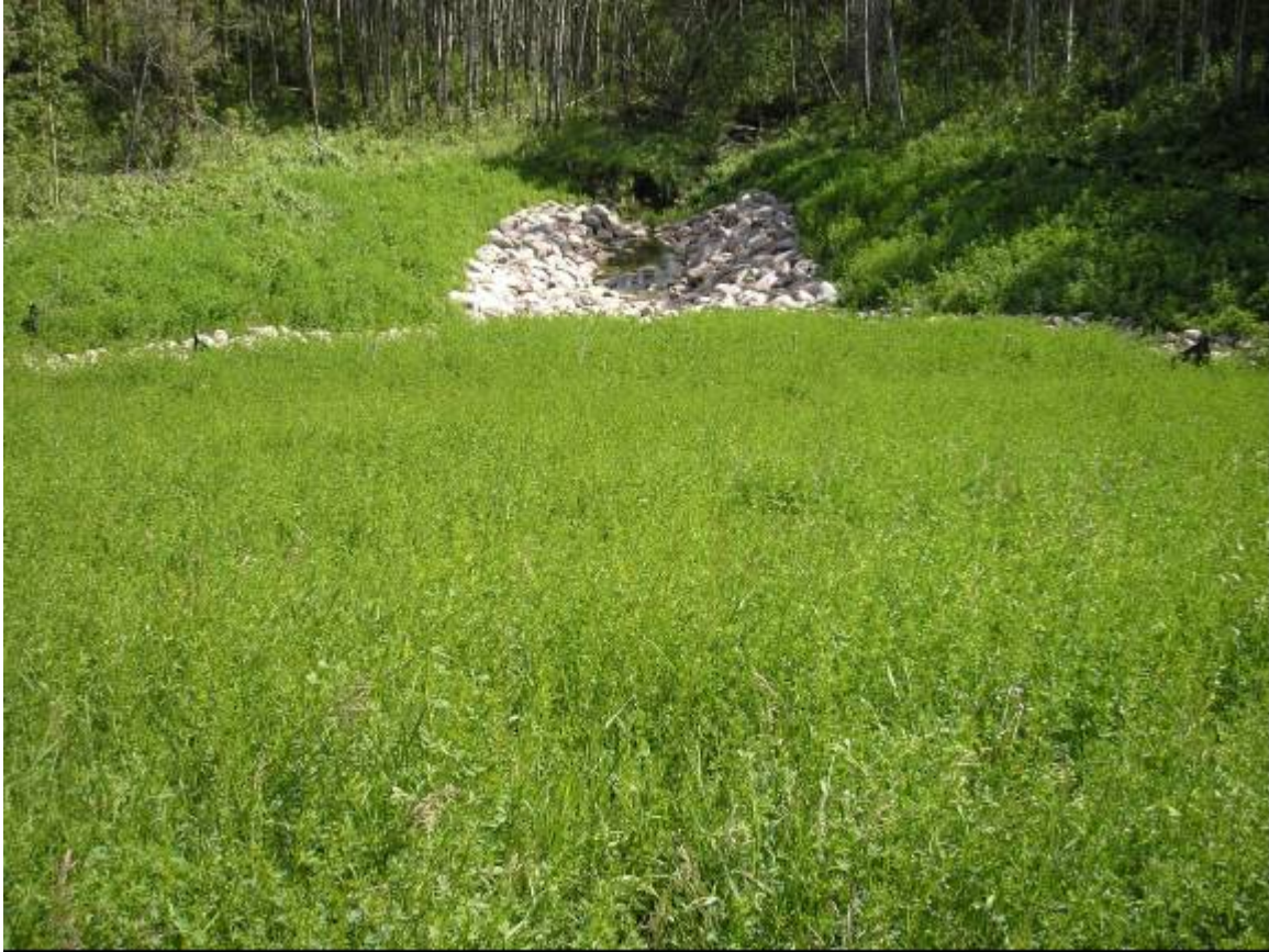
Photo 1 - Looking south at the culvert outlet, swale and reconstructed slope, June 13, 2007.