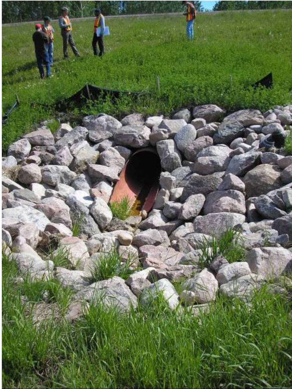
Photo 2 - Looking south at the culvert inlet, June 13, 2007.