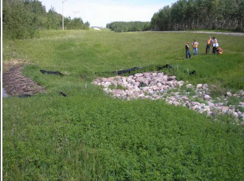
Photo 3 - Looking east towards culvert inlet, sub-drain outlet and swale riprap of Site #1A, June 13, 2007.