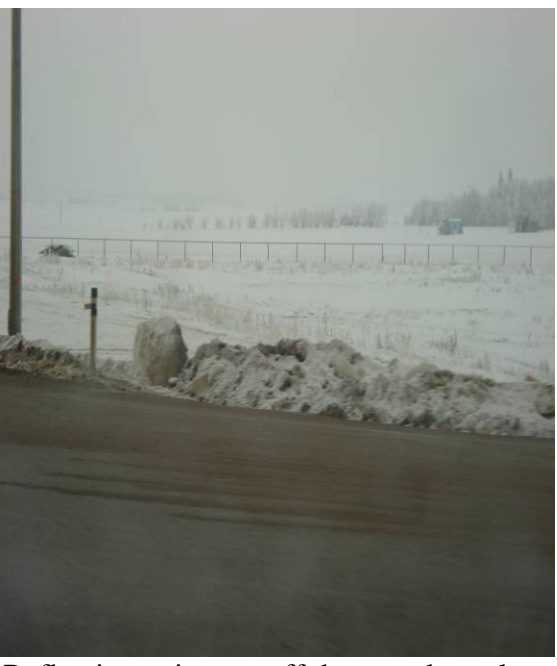
Reflective strip torn off the round regular delineator (common Problem)