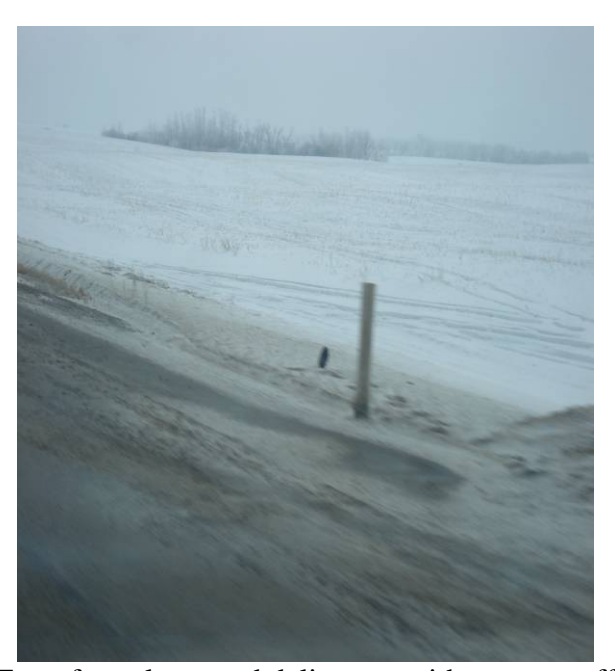
Top of regular round delineator with top torn off

The Carsonite delineators are performing very well at this location. A small percentage of the Carsonite delineators are damaged, however they are still in place.