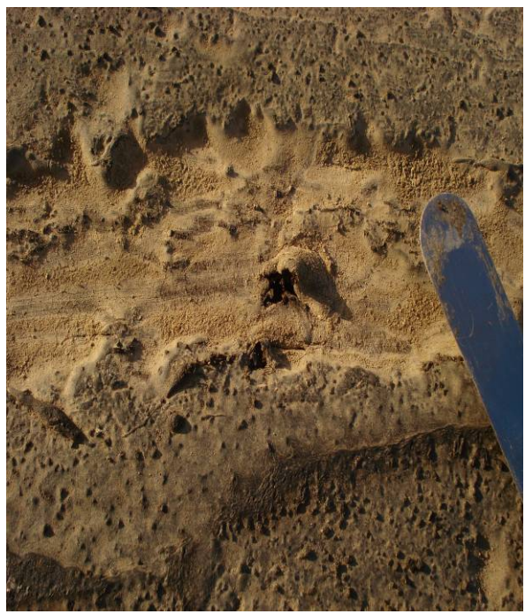
Sealant is very pliable