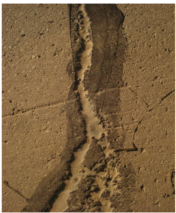
Transverse crack, treated with Deery #3723 sealant