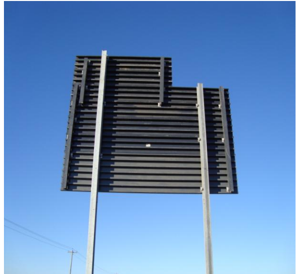
Front and back of directional sign