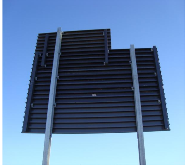
Front and back of directional sign