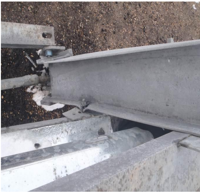
Post slightly twisted at end (notice tear at bolt location)