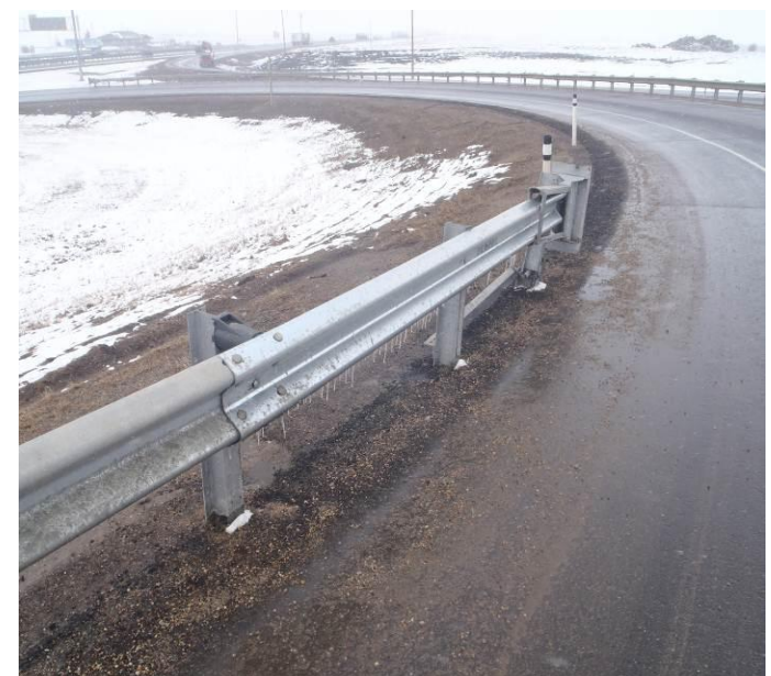
April 16, 2014 (after collision)