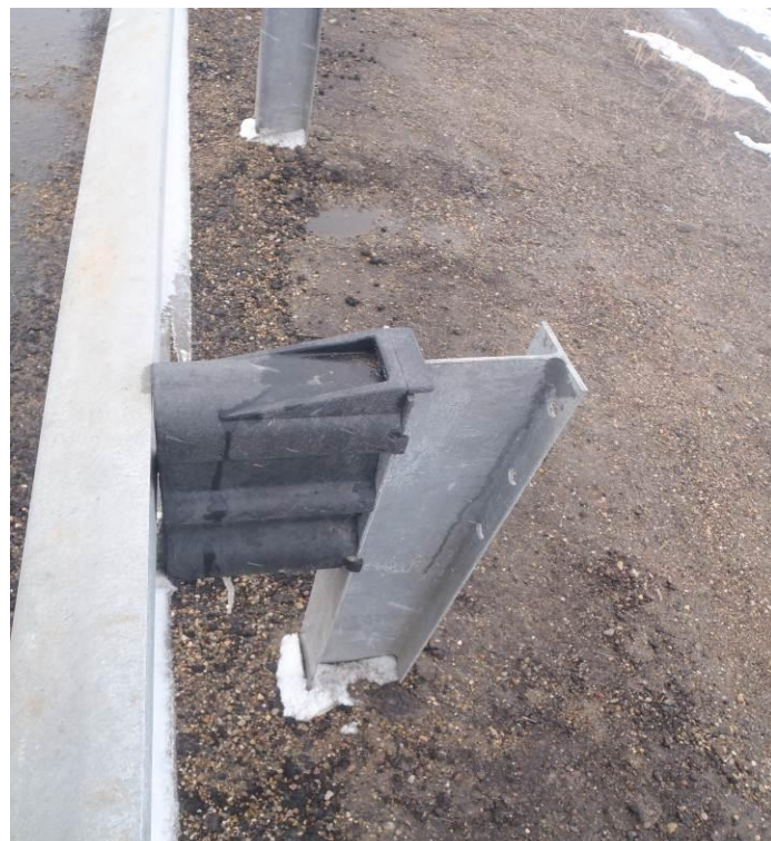
End treatment, after collision