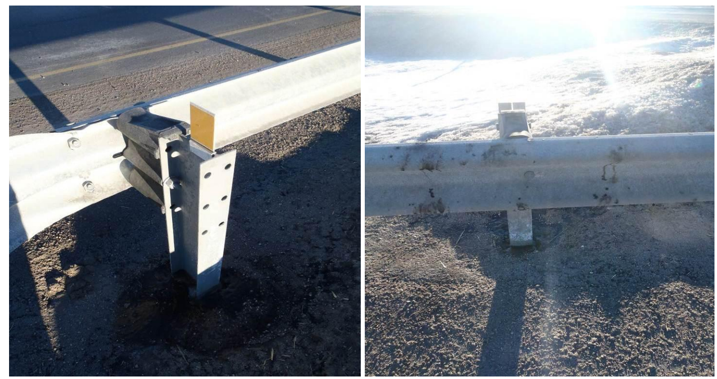
King Block appears to be performing very well at this time. This product is currently listed under the Trail category with an expiry date of November 2016.

Continue to evaluate yearly to determine any defects.