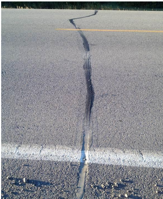
Sealant is performing very well in the transverse cracks, good cohesion and adhesion.