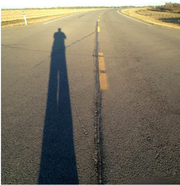
Sealant is still present longitudinally

Longitudinal crack, performing well, no adhesion failures were noticed