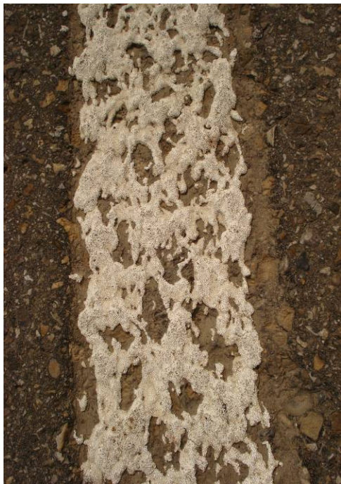
W. edge line