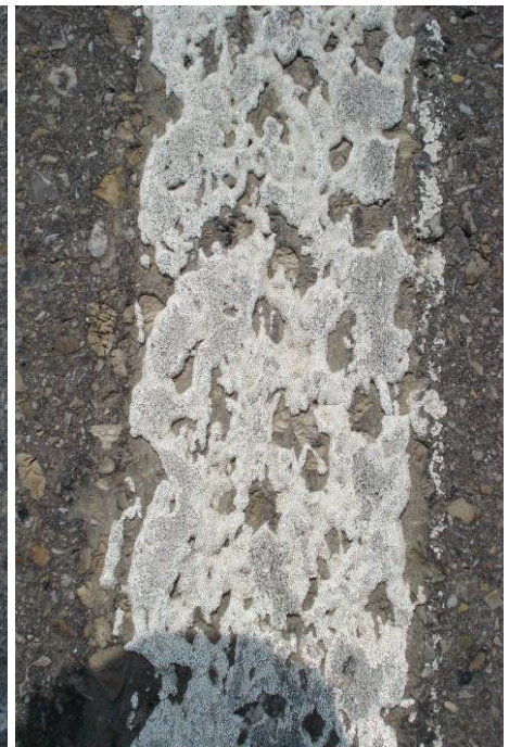
E. edge line

Retro readings west white edge line: 307, 270, 306, 324, 280, 289, 303, 297, 239, 297 – Average: 291Mcd