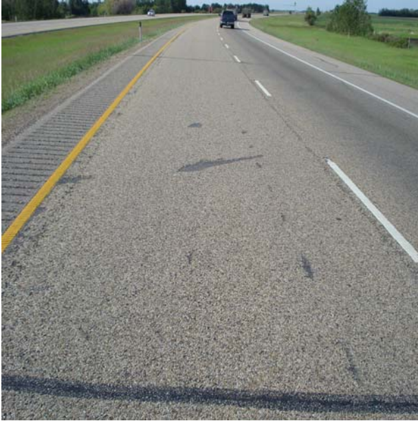
Markings look good