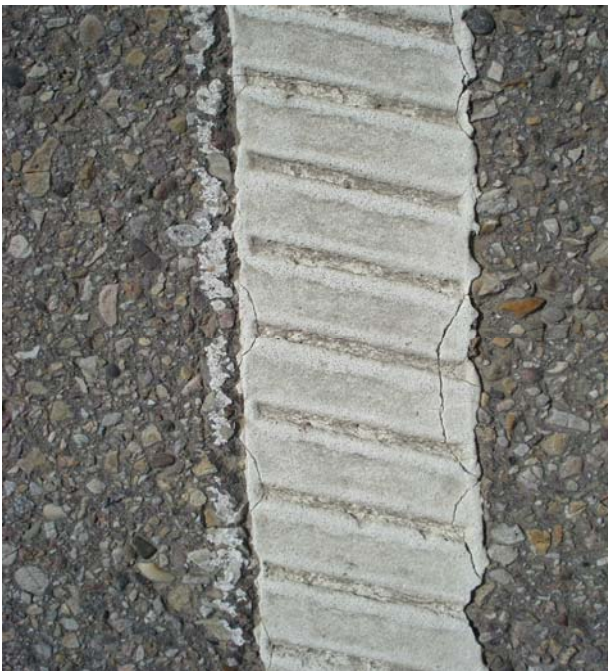
White edge line