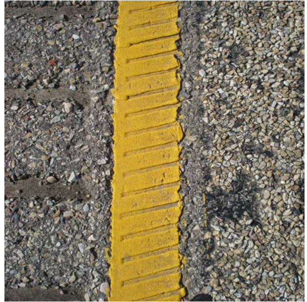
Yellow edge line