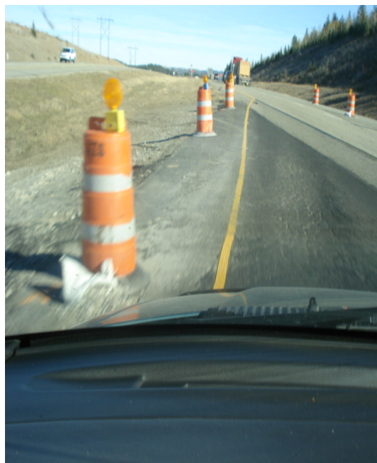
Yellow temporary tape (EBL)