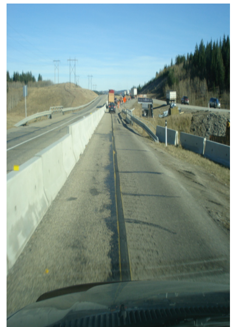
Black out tape EBL

The 3M Stamark temporary tape looked very good at this location. These temporary markings are providing excellent delineation. These two products will be discussed at the new products evaluation committee meeting on December 4, 2008 for recommendation to advance to the Trial Products category of the Alberta Transportation Products List.